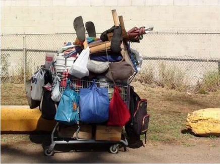
Minister to the Needy