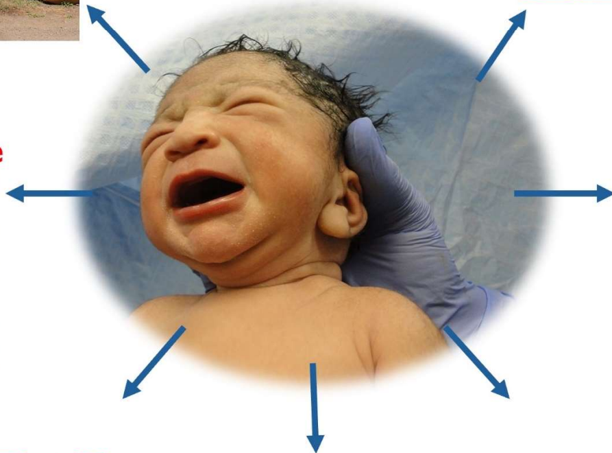
Be A Mentor