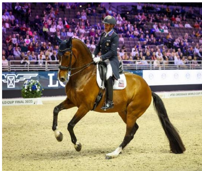
Steffen Peters and Suppenkasper