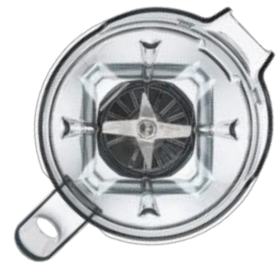
1.4 L Interlock Standard Container