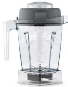
1.4 L Classic Standard Container/Lid/Cap Blade/Tamper