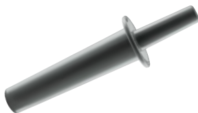
Mini Tamper - (suits 0.9 L & 1.4 L Container)

There's a perfect size tamper to fit every container. The tamper presses ingredients into the blades, allowing you to process thick and frozen mixtures with ease.