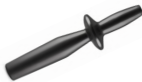
Low Profile Tamper (suits 2 L Low Profile Standard Container)