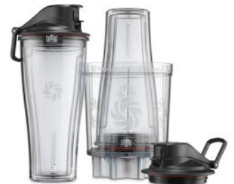
Personal Cup Adapter, Two 600 ml Cups & Two Lids