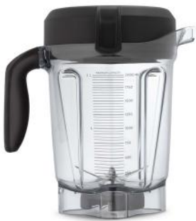
2 L Low Profile Standard Container/Lid/Cap Blade/Tamper