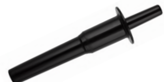
Classic Tamper (suits 2 L Classic Standard Container)