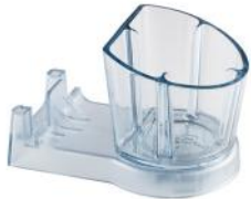
Explorian Series Tamper Holder