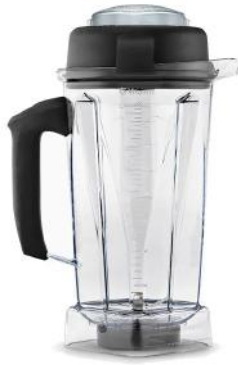
2 L Classic Standard Container/Lid/Cap Blade/Tamper