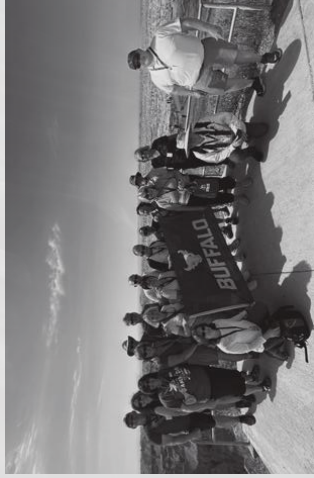
University at Buffalo alumni on Orbridge's National Parks & Lodges of the Old West 2024 travel program.

PRRRT STD U.S. POSTAGE PAID PERMIT NO. 825 SAN DIEGO, CA