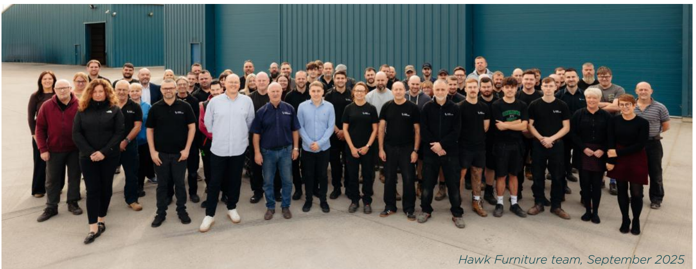
Hawk Furniture team, September 2025