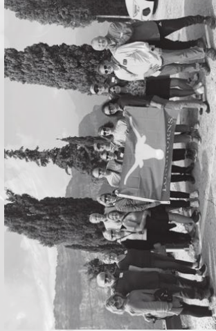
Texas Exes alumni on Orbridge's Flavors of Northern Italy travel program.

PRSRT STD U.S. POSTAGE PAID PERMIT NO. 825 SAN DIEGO, CA