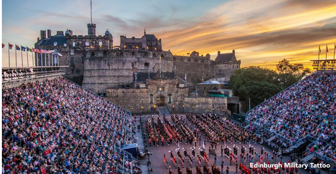
Edinburgh Military Tattoo