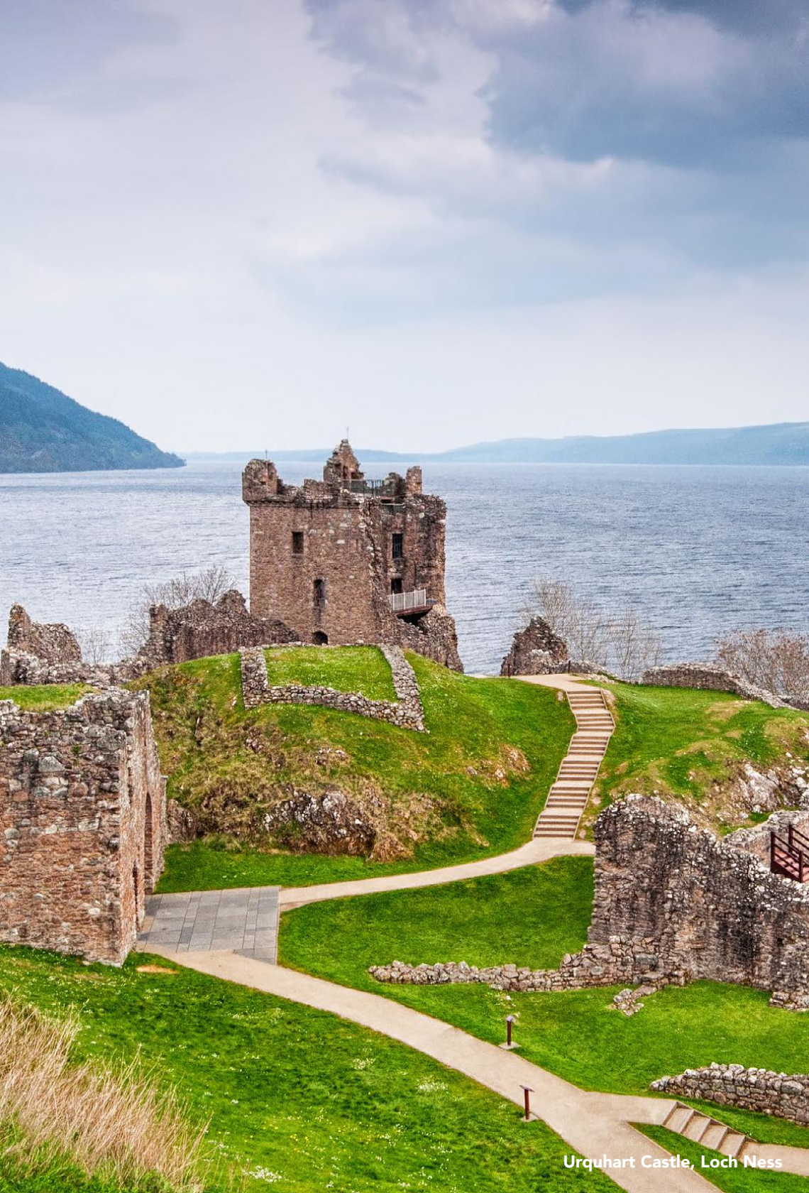
Urquhart Castle, Loch Ness