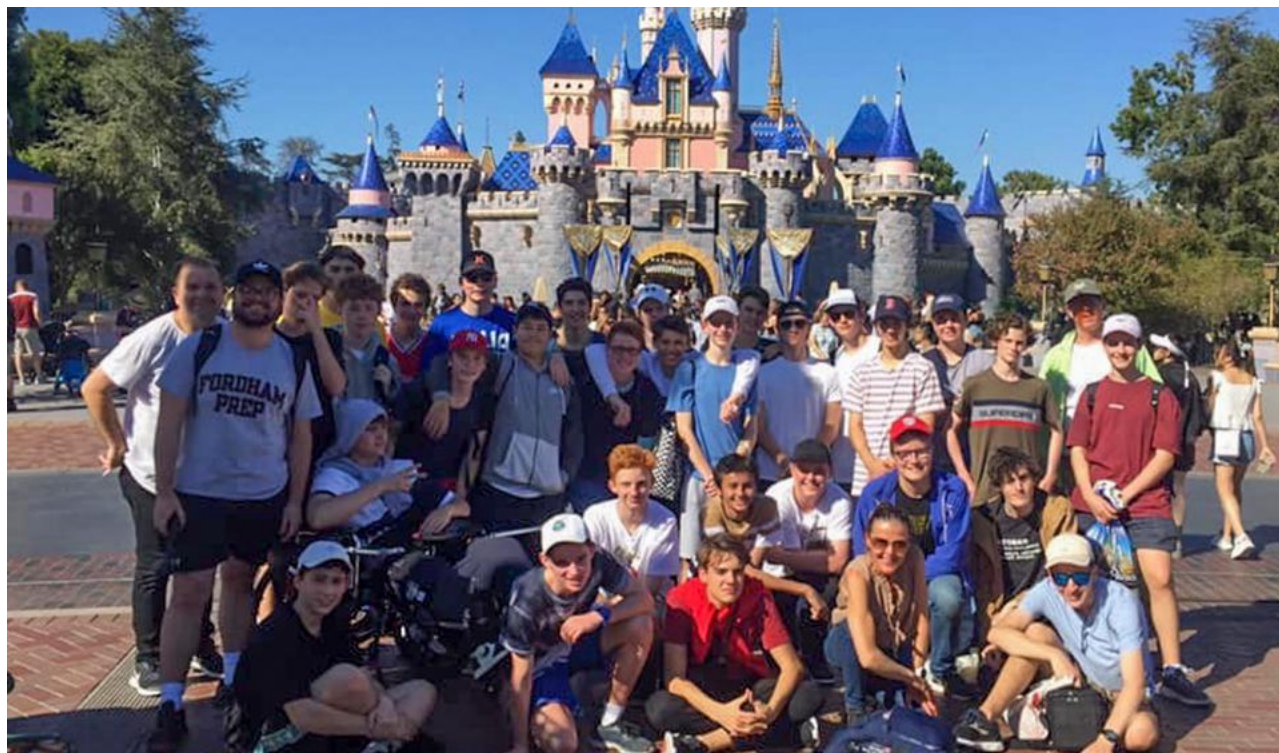
Above The students wind down at Disneyland

The highlight of Semester 2 has undoubtedly been Riverview's first ever Drama and Music Tour of the USA. At the beginning of the Term 3 holidays, 29 boys and four staff members embarked on their greatest ever Performing Arts pilgrimage to experience the hustle and bustle of New York City and to immerse themselves in Broadway shows, Acting workshops, backstage tours, music recording studios, high school visits and service opportunities.