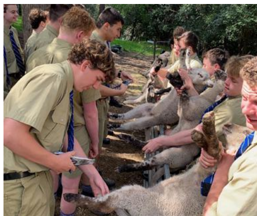
Above Agriculture students working at the farm

The College farm has a rich and colourful history - from a Dairy in the early 1900s to an integral practical component for the Agricultural & Primary Industry curricula today, not to mention bovine assassination in the Rose Garden!