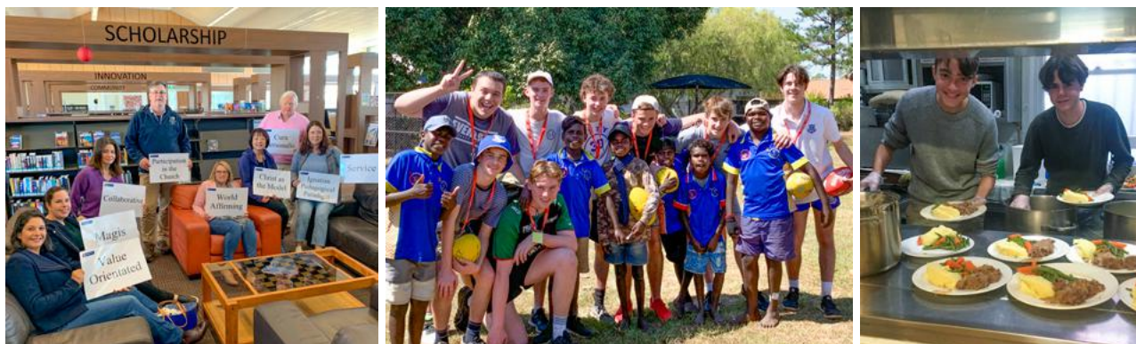
Above: Year 3 of Staff Formation | Serving at Bathurst Island | Year 10 city placement