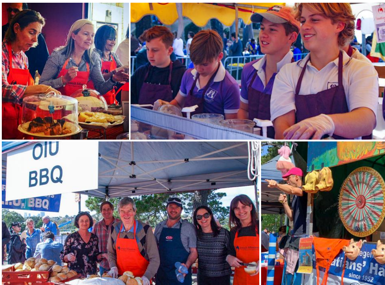
Above Images from the 2019 Indian Bazaar

This year marked the 68th year of the Jesuit Mission Indian Bazaar - a fête that began in 1952 in support of the young Australian Jesuit missionaries who embarked on a life-long journey to India to serve the poor. Since then, every year, Jesuit communities and friends have come together in solidarity to support people who are living in the margins, suffering the indignities of poverty and injustice.