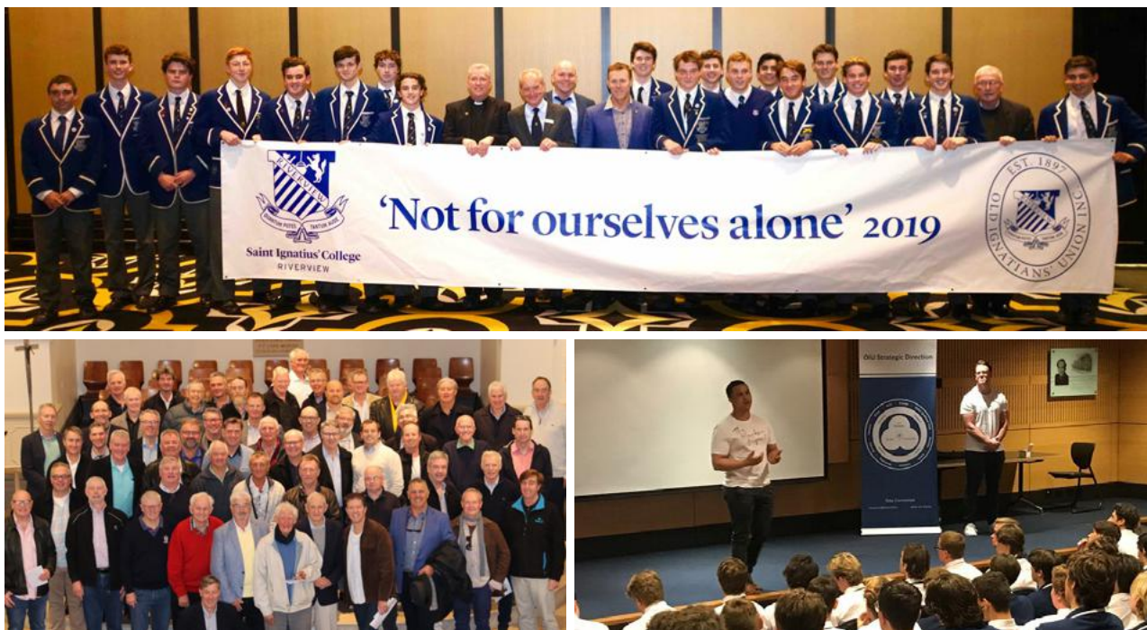
Above 2019 OIU Sports Lunch | Below left: 40 Year reunion | Below right: The Banksia Project addresses the Year 12 cohort

Every year group owes much to those who organise their Class Reunions, which takes significant diligence. We also acknowledge that attending reunions can require a great deal of bravery as there are many in every cohort who struggle, some publicly others privately, which can play out in all sorts of ways.