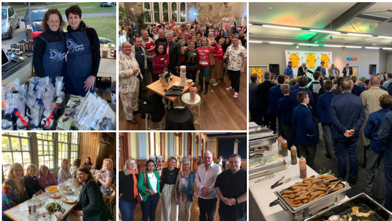
Images clockwise from top left The Cana Market Stall, Year 8 parents' Christmas night, Fathers' Day breakfast, Easter Mass, Year 10 mums' lunch

In 2012, approximately 100 families entered the gates of Regis to wave their sons off as they commenced their education at Saint Ignatius' College Riverview. Some of those families were very familiar with their surroundings; others were completely new and navigating their way through what seemed like a foreign world. That number of families doubled two years later in Year 7, and increased again in the ensuing five years. In September 2019, those families and their sons celebrated the end of their formal education at Riverview at the Valette Mass and Dinner.