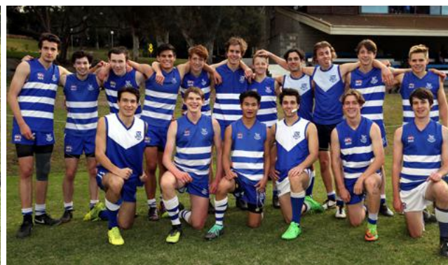
Above AFL 1st XVIII and AFL 2nd XVIII