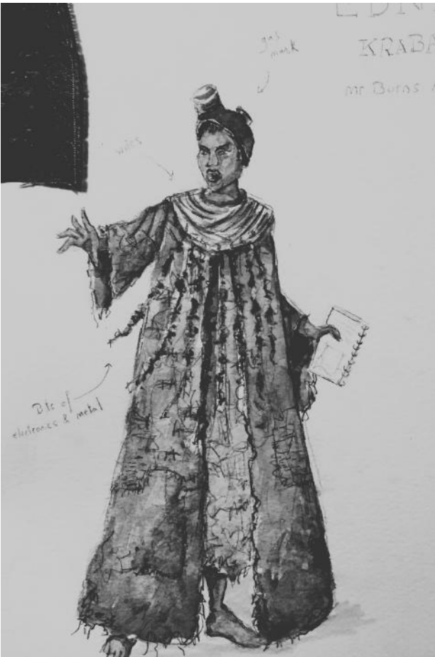
Costume design by Calypso Michelet for Act 3: Edna Krabappel