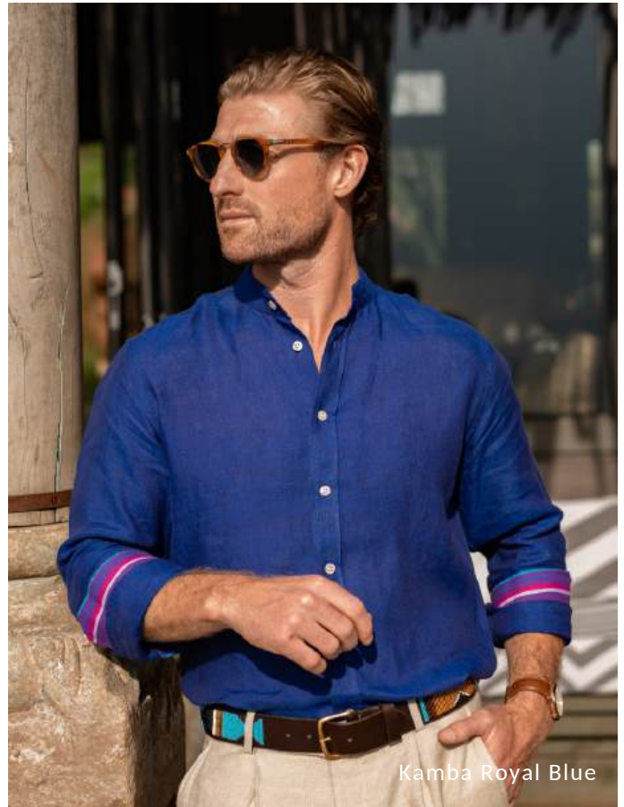
Kamba Royal Blue

100% Linen Grandfather Collar Shirts | £120