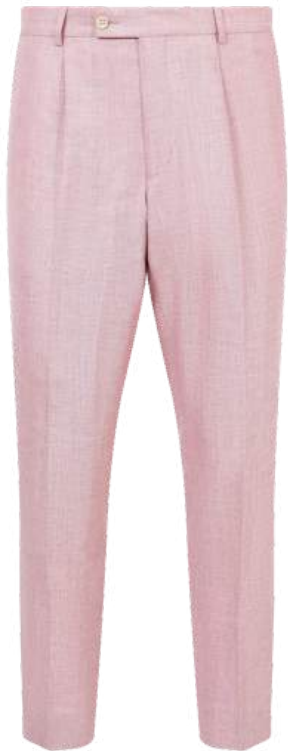
Dusty Pink Linen Blend Suit Trousers | £245 Sizes | 30" - 40" waist / 34" inside leg