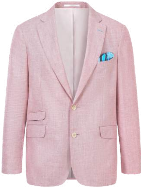
Dusty Pink Linen Blend Blazer | £425 Sizes | 38 R/L - 48 R/L

Full Suit - £620 (£50 Discount when purchased together)