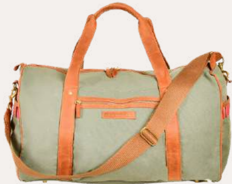
Canvas Explorer Duffle Bag Safari Green £450