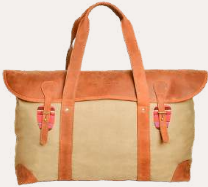
Canvas Weekender Bag Tan | £420