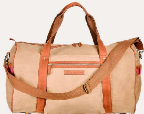
Canvas Explorer Duffle Bag Tan | £450