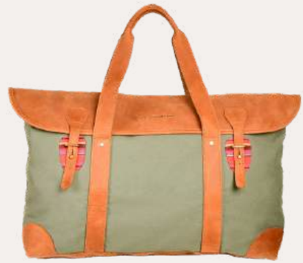
Canvas Weekender Bag Khaki Green | £420