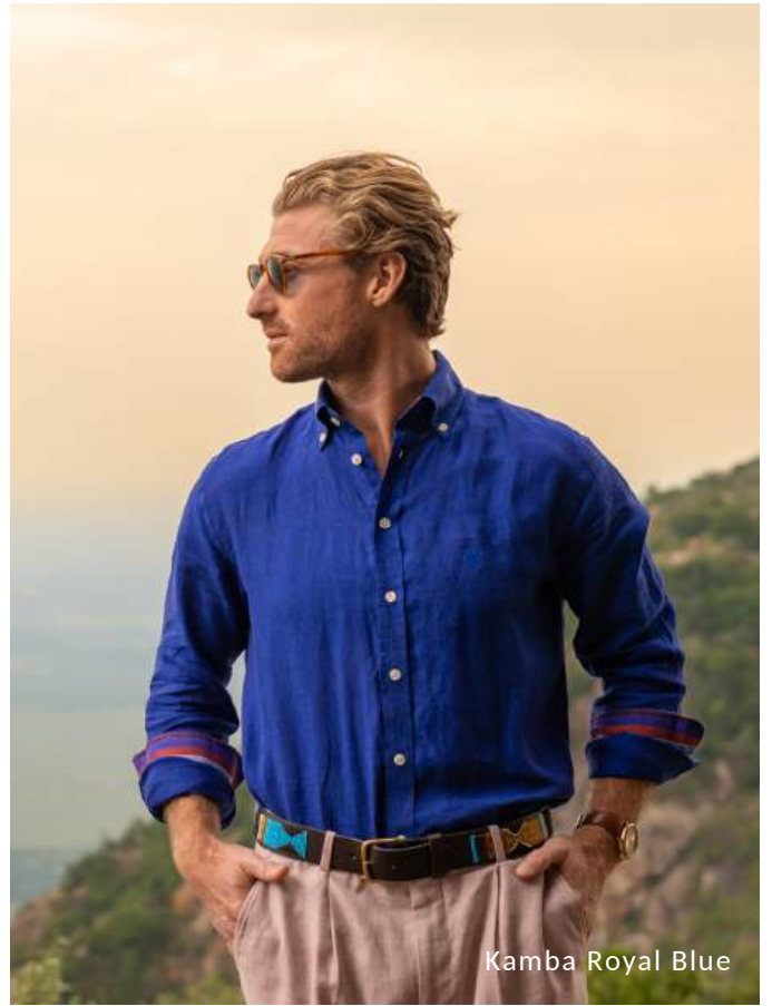
Kamba Royal Blue