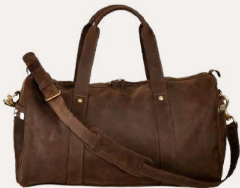
Leather Explorer Duffle Bag Mocha | £550