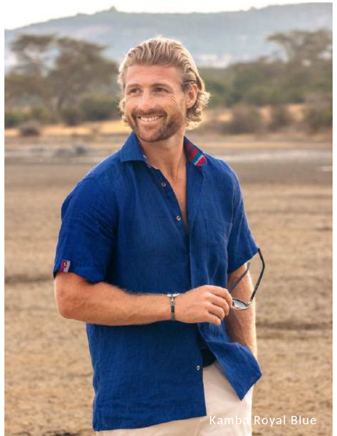
Kamba Royal Blue

All 100% Linen Short Sleeve Shirts | £99