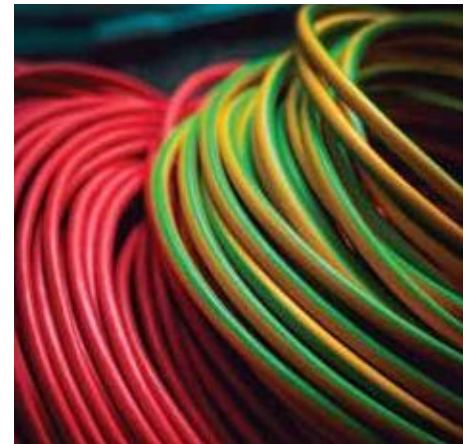
ABB Acme Electric Dongan Eaton Federal Pacific GE Industrial Solutions Jefferson Electric MGM Transformer Co. Micron Olsun Electrics SESCO Sola HD/Emerson Sorgel Standard