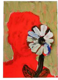
63. Matt Macken - Red (Acrylic and spray paint on paper)