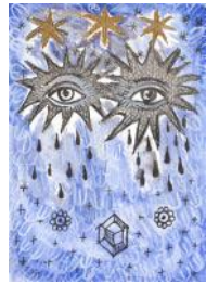
9. Hazel Florez - Sea of Stars (Watercolour, ink and metallic pigments on paper)