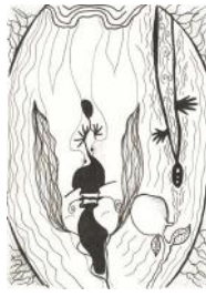
14. Efrat Merin - Before Time (Ink on paper)