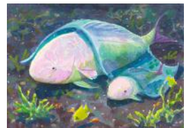
36. Minyoung Choi - Blanket (Watercolour on paper)