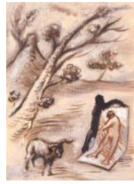
39. Lisa Ivory - Flatter (Oil on paper)