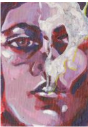
7. Abigail McGinley - Olio (Oil on canvas)