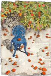
19. Lara Cobden - The Blessing (Ink on watercolour paper)