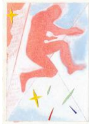
29. Lucy Jagger - Love that Gives Us Ourselves (ii) (Acrylic and pastel on paper)