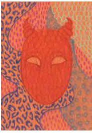
61. Renin Bilginer - The Hedonist (Pencil on khadi paper)