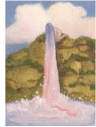
42. Monika Marchewka - Waterfall (Oil on paper)