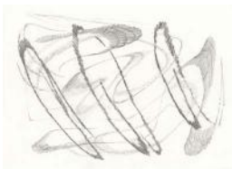
46. Alfie Rouy - Automatic Drawing No. 3 (Graphite on paper)