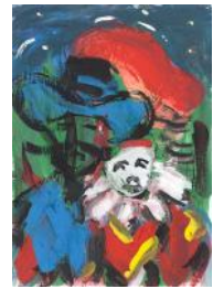
69. Lasse Thorst - Clubbing (Gouache on paper)