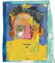
93. Andrew Salgado - Untitled (1) (Mixed media on paper)