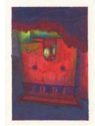
105. Benji Thomas - White Rock Theatre (Felt tip and coloured pencil on paper)