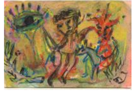
99. Paige Perkins - This Moment (Ink and wax crayon on paper)