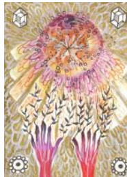
11. Hazel Florez - Fierce Pure Life (Watercolour, ink and metallic pigments on paper)