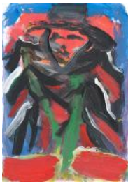
70. Lasse Thorst - Blue Tone (Gouache on paper)