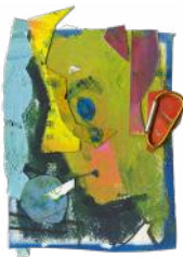
94. Andrew Salgado - Untitled (2) (Mixed media on paper)