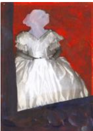
58. Zac Merle - Her Worn Bridal Gown (Oil paint and collage on paper)