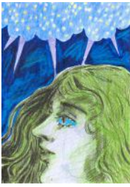
73. Julie-Ann Simpson - Faring Stars (Mixed media on paper)