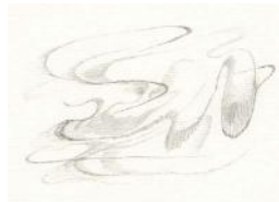
44. Alfie Rouy - Automatic Drawing No. 1 (Graphite on paper)