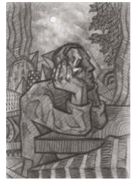
51. Samson Tudor - Waiting for the Storm (Graphite on paper)