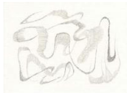
47. Alfie Rouy - Automatic Drawing No. 4 (Graphite on paper)