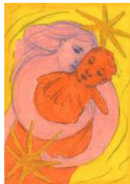
35. Rebecca Sammon - Curl In (Pencil and oil pastel on paper)