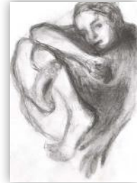
81. Rie Kitagawa - The Body (Charcoal and graphite on paper)