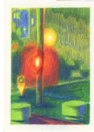
104. Benji Thomas - Marina (Upside Down) (Felt tip and coloured pencil on paper)