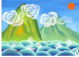
26. Siena Park - The Lake in the Eye (Acrylic on paper)