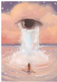
43. Monika Marchewka - Waterfall of Despair (Oil on paper)