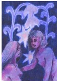
71. Julie-Ann Simpson - Seeds (Mixed media on paper)