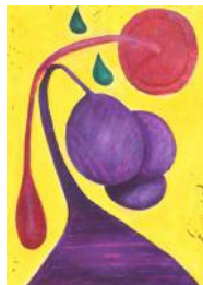
23. JURIT - Elegy in Joy 2 (Linocut and oil on paper)