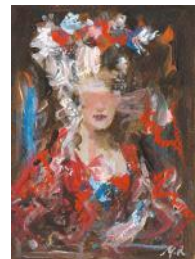
84. Mandy Racine - Red Muse (Acrylic and pastel on paper)