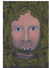
95. Ben Edge - Green Man (Oil on canvas paper)