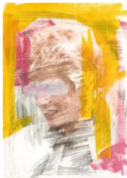
59. Zac Merle - Flames in Their Eyes (Acrylic and image transfer on paper)