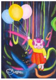
25. Siena Park - Wishes Flame Together (Acrylic on paper)