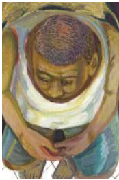
55. MJ Torrecampo - On Aging (Acrylic on paper)