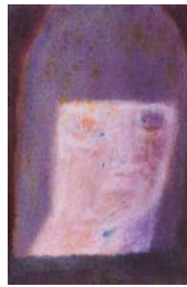
68. Loren Erdrich - A Form and The Sea (Water, dye, water soluble pastel, coloured pencil and UV varnish on paper)