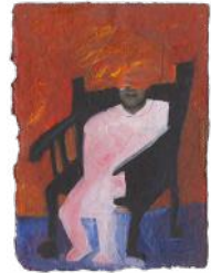
57. Zac Merle - Absent Contemplation (Oil paint and collage on paper)