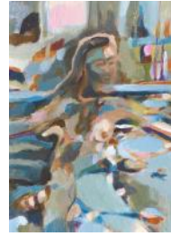
90. Ella Shepard - All the People We Pass Through (Oil on paper)