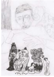
64. Matt Macken - Grey (Pencil on paper)