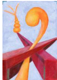
20. JURIT - The Flesh and the Answer 1 (Linocut and oil on paper)