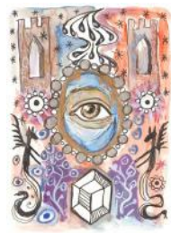
12. Hazel Florez - The Lake in the Eye that Knows (Watercolour, ink and metallic pigments on paper)