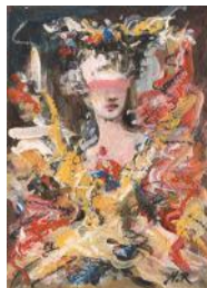
83. Mandy Racine - Yellow Muse (Acrylic and pastel on paper)