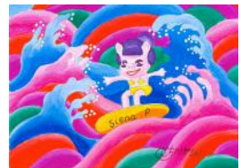
24. Siena Park - This Wave of the Sea (Acrylic on paper)