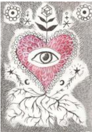
10. Hazel Florez - The Blessing is in the Seed (Watercolour, ink and metallic pigments on paper)