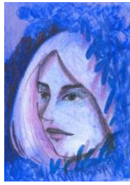
74. Julie-Ann Simpson - Lake (Mixed media on paper)