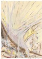
34. Kolja Kärtner Sainz - Untitled (2) (Oil and ink on paper)