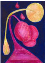
22. JURIT - Elegy in Joy 1 (Linocut and oil on paper)