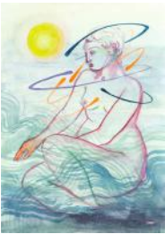
79. Olivia Mansfield - Amphitrite (Gouache and acrylic on paper)