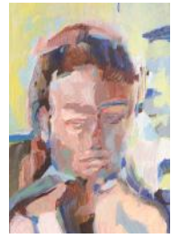
87. Ella Shepard - Mumma Always Said Look up to the Sky, Find the Light on a Cloudy Day (Oil on paper)