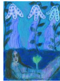
72. Julie-Ann Simpson - Rivers (Mixed media on paper)