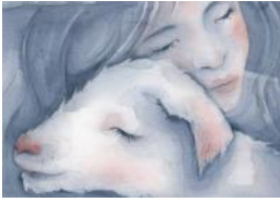
1. Naomi Boiko-Stapleton - Cloud of Home (Watercolour on cotton)