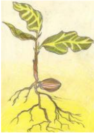
76. Nettle Grellier - This Seed (Pencil and coloured pencil on paper)