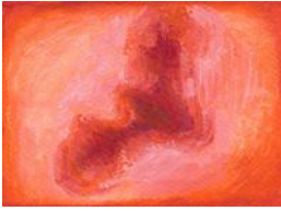
97. Ruth Calland - Nightgirl (Oil on paper)