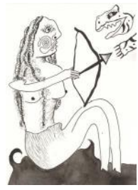
15. Efrat Merin - The Hunt (Ink on paper)