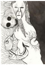
13. Efrat Merin - The Return (Ink on paper)