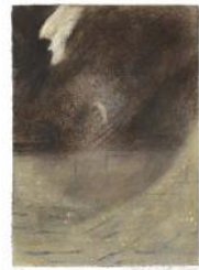
33. Kolja Kärtner Sainz - Untitled (1) (Oil and ink on paper)