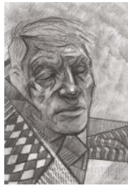
50. Samson Tudor - Waiting for the Sun (Graphite on paper)