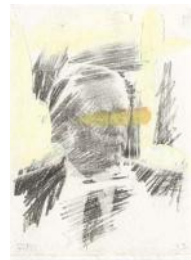
60. Zac Merle - Hold the Light of the Dawn (Acrylic and image transfer on paper)