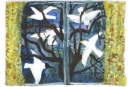
66. Alice MacDonald - View from my Window (Watercolour and collage on paper)