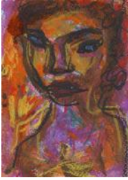
100. Paige Perkins - Many Wishes Flaming (Oil pastel, watersoluble wax crayon on paper)