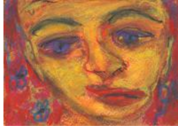
98. Paige Perkins - The Look (Water soluble oil pastel on paper)