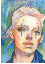
5. Marina Renée-Cemmick - Lola (Coloured pencil on paper)