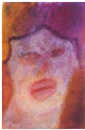
67. Loren Erdrich - A Form and The Sun (Water, dye, water soluble pastel, coloured pencil and UV varnish on paper)