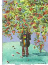
17. Lara Cobden - Healing of the Wound (Ink on watercolour paper)