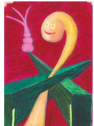
21. JURIT - The Flesh and the Answer 2 (Linocut and oil on paper)