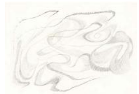
45. Alfie Rouy - Automatic Drawing No. 2 (Graphite on paper)