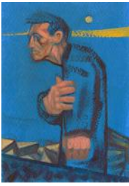
49. Samson Tudor - Waiting for the Rain (Oil on paper)