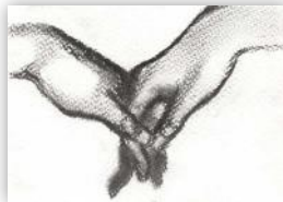
80. Rie Kitagawa - The Hands (Charcoal and graphite on paper)