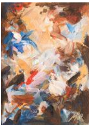
82. Mandy Racine - Religion (Acrylic and pastel on paper)