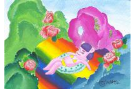
27. Siena Park - Pot Luck (Acrylic on paper)