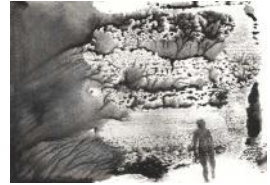
54. Amy Steel - Fuses (Printing ink and charcoal pencil)