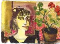
65. Alice MacDonald - Jess and Geranium (Watercolour and collage on paper)