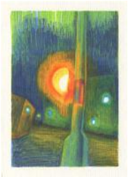
103. Benji Thomas - Handmaid's Tale (Felt tip and coloured pencil on paper)