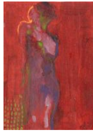
8. Abigail McGinley - The Vapours of La Marais (Oil on canvas)