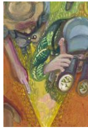
56. MJ Torrecampo - The Left 'Y' of the Tree (Acrylic on paper)