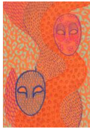
62. Renin Bilginer - Two Faces (Pencil on khadi paper)