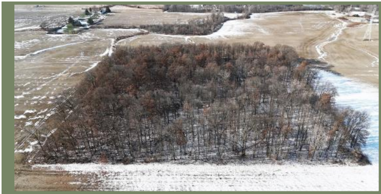
TRACT 10 (RIGHT PIC) WOODS ON THE NORTH PART OF THE TRACT