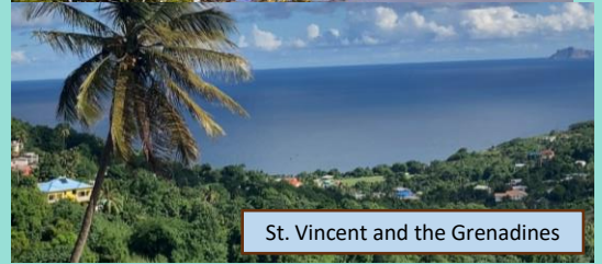
St. Vincent and the Grenadines

JICA is a Japanese government agency responsible for executing Japanese Official Development Assistance (ODA) . JICA has 96 overseas offices (as of July, 2020) and conducts ODA projects in 150 developing countries (during fiscal year 2019). JICA has offices in St. Lucia, Jamaica, Belize and Dominican Republic in the Caribbean. We are enhancing the capacity of DR office to serve better to Caribbean people.