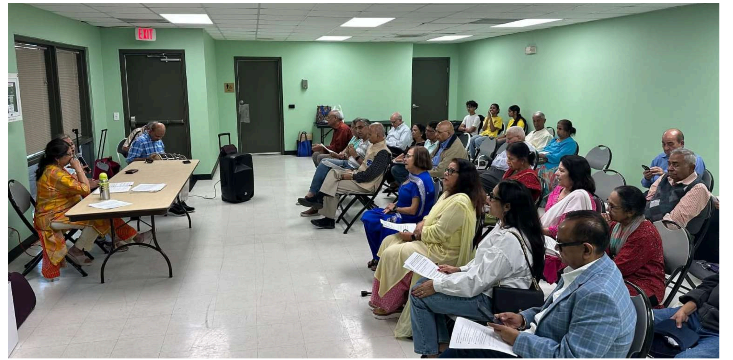
Seniors attended tax session and activities in Sugar Land, TX

Seniors came together for a simple tax discussion covering Required Minimum Distributions, donations, and gift taxes on March 14 in Sugar Land, TX. Participants enjoyed a Q&A, songs, a Ram Navami quiz, and group activities. Youth volunteers helped with planning and refreshments, keeping everything running smoothly. The event provided useful tax and financial tips mixed with cultural activities at the monthly senior meet-up.