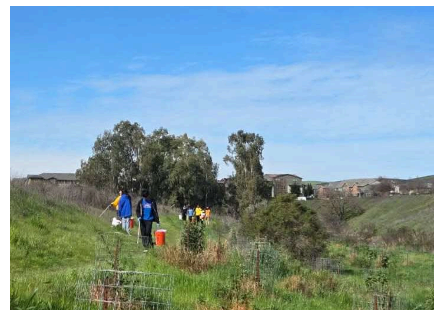
Over 30 volunteers restored creek areas in the Bay Area, CA

Over 17 Sewa volunteers teamed up with participants from “Living Arroyos” organization to clear trash and refresh local creek areas in the San Francisco Bay Area on February 21. Through the creek cleanup, the team focused on supporting ecosystem health and improving public spaces. The effort contributed to protecting local flora and fauna. Representatives from “Living Arroyos” acknowledged consistent volunteer support and effective participation from Sewa in environmental initiatives.