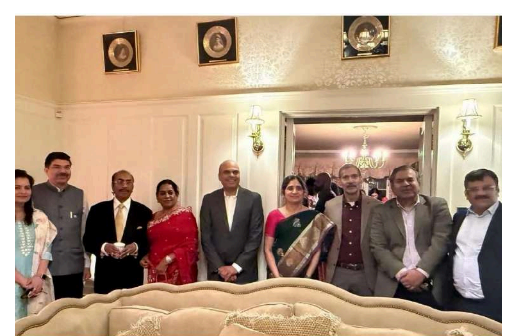
Colorado Leaders engaged in dialogue and networking at the event in Denver, CO