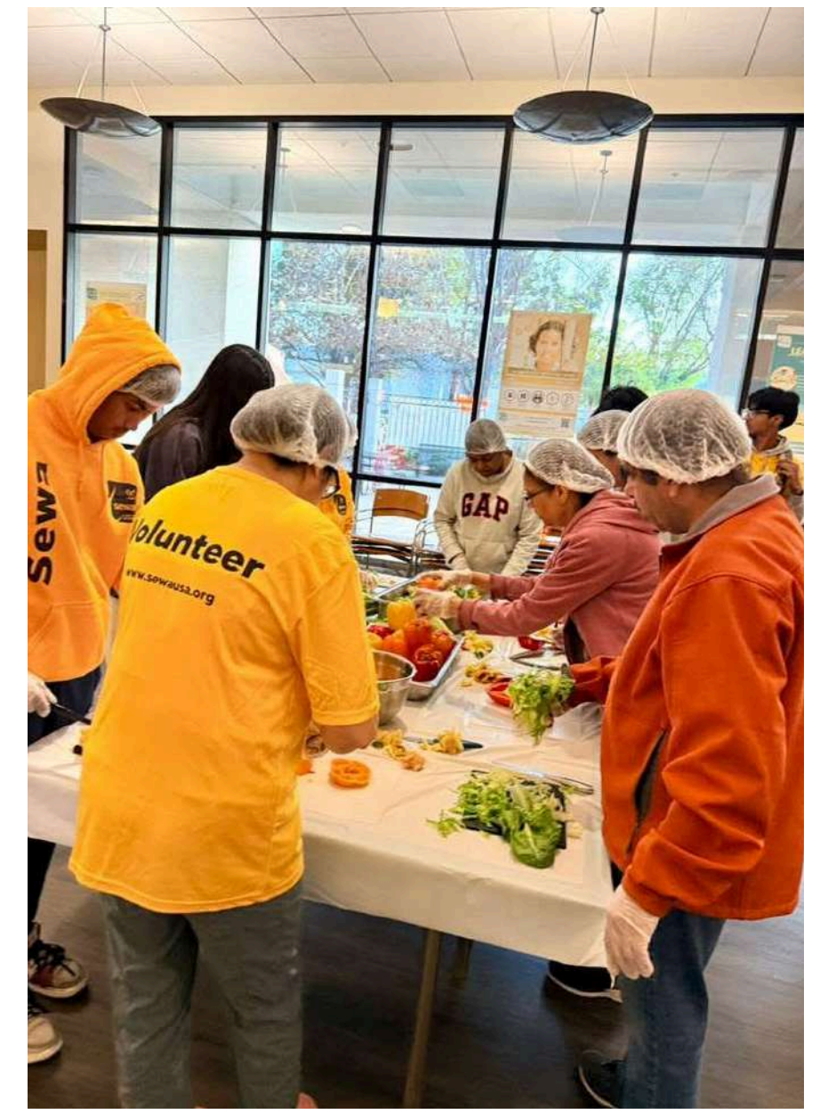
More than 30 volunteers prepared 270 meals in Milpitas, CA

A team of about 30 volunteers, including children aged 3–7, worked together to prepare 270 burritos for partner organizations in Milpitas, CA on March 14. They handled ingredient prep, assembly, and packaging to support timely delivery. Loretto Brigade and AGAPE Foundation distributed the meals to individuals in need. The Burrito Sewa event showed organized teamwork, inclusive involvement, and efficient execution.