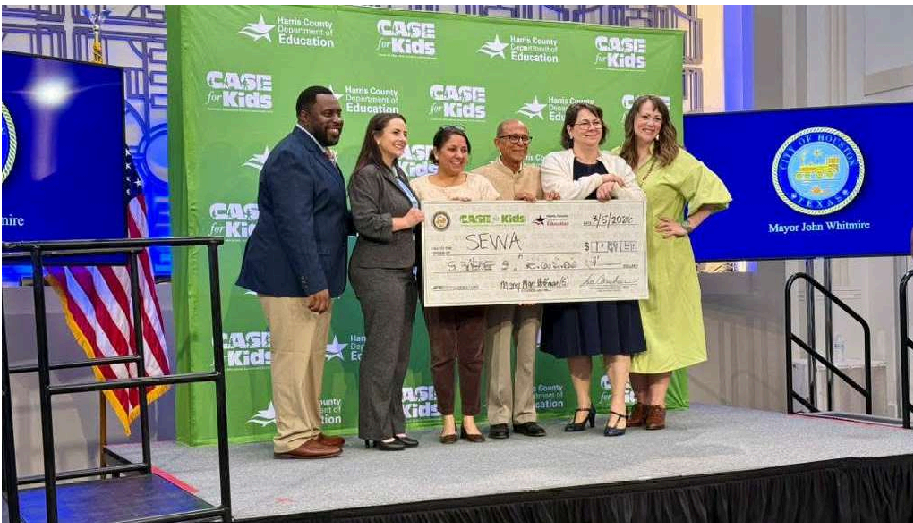
Sewa was recognized by the city for its service impact in Houston, TX.

Sewa received recognition for its service impact across Districts J and G at an event hosted by CASE for Kids in partnership with the Houston City Council on March 5. A council member presented the award, acknowledging consistent efforts and program delivery across focus areas.