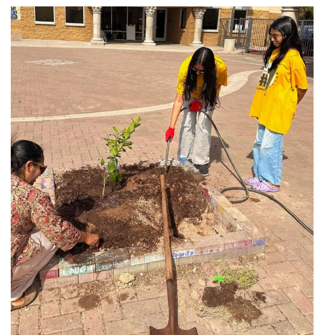
Volunteers beautified campus in Peoria, AZ during 9/11 service event

More than 30 youth and adult volunteers joined together on March 29 to support Explore Academy in Peoria, Arizona. They worked across the campus by weeding, clearing shrubs and tree cuttings, cleaning outdoor areas, planting trees, and adding fertilizer. Their shared effort made the school cleaner and more inviting for students.