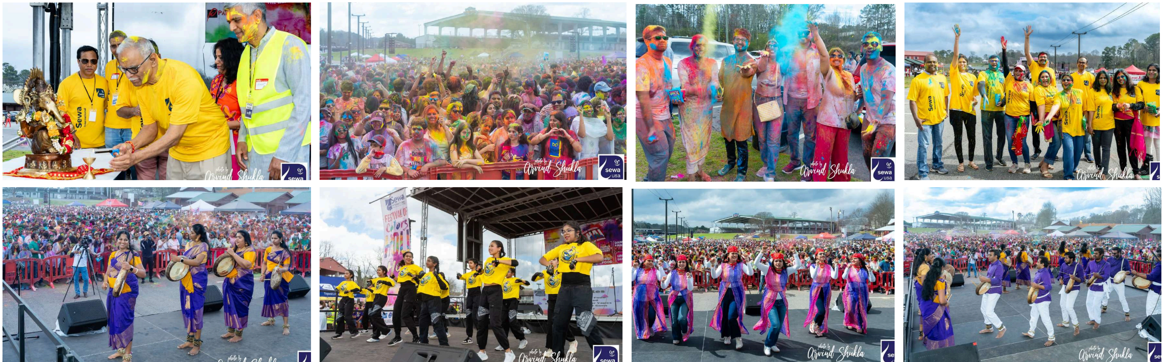
Attendees immersed themselves in the colorful spirit of Holi, enjoying music and dance reflecting festival's joy

The Atlanta Chapter of Sewa International USA hosted its 19th annual "Holi – Festival of Colors" at the Cumming Fairgrounds on March 7, bringing together thousands of attendees from across the community for a vibrant and joyful celebration. The event created a festive atmosphere. People of all ages welcomed the arrival of spring with colors, music, dance performances, and a variety of flavorful foods. Families and friends enjoyed the traditions associated with Holi, a festival that symbolizes renewal, positivity, and togetherness. Speaking at the event, Fulton County Commissioner Bridget Thorne said, "Events like this bring people together and celebrate our rich cultural diversity..."