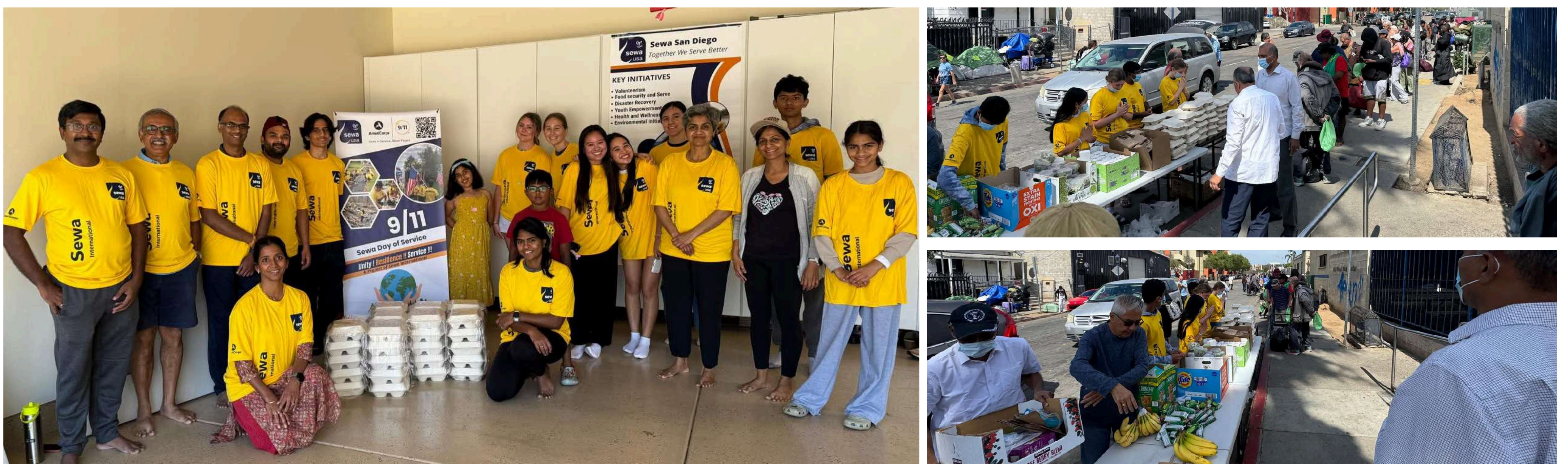
Sewa San Diego volunteers served over 300 meals through outreach in San Diego, CA

Sewa volunteers prepared and distributed over 300 fresh burritos in San Diego, CA, on March 22. Over 25 volunteers including many students coordinated cooking and distribution to ensure burriotos reached people who needed them. Burriotos were packed in ready-to-go boxes and energy bars and fruits were included.