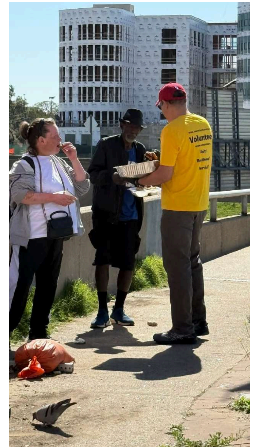
Sewa volunteers served meals across two locations in Dallas, TX

Sewa volunteers have expanded meal distribution program to two locations in Dallas. Working with ISKCON and Little Caesars to serve hot meals to homeless shelter residents and other individuals experiencing homelessness. Volunteers handle food preparation, distribution, and delivery of rice, beans, cookies, and pizza and manage logistics and outreach at both sites.