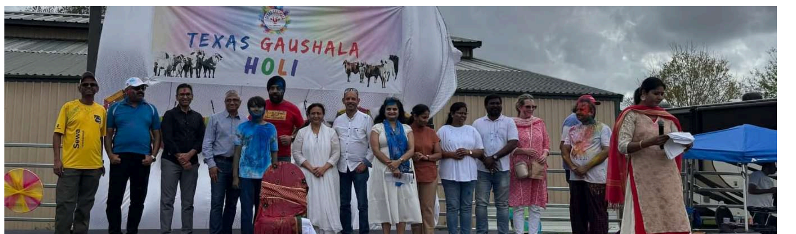
Over 30 volunteers supported festival operations in Waller, TX

A team of over 30 Sewa volunteers supported the Texas Gaushala Holi celebration, which welcomed more than 2,500 people in Waller, TX, on March 7. They handled parking, guided the crowd, set up and removed tents, and cleaned the site housing 60+ cows. Their teamwork helped manage the crowd and ensured the event was conducted as planned.