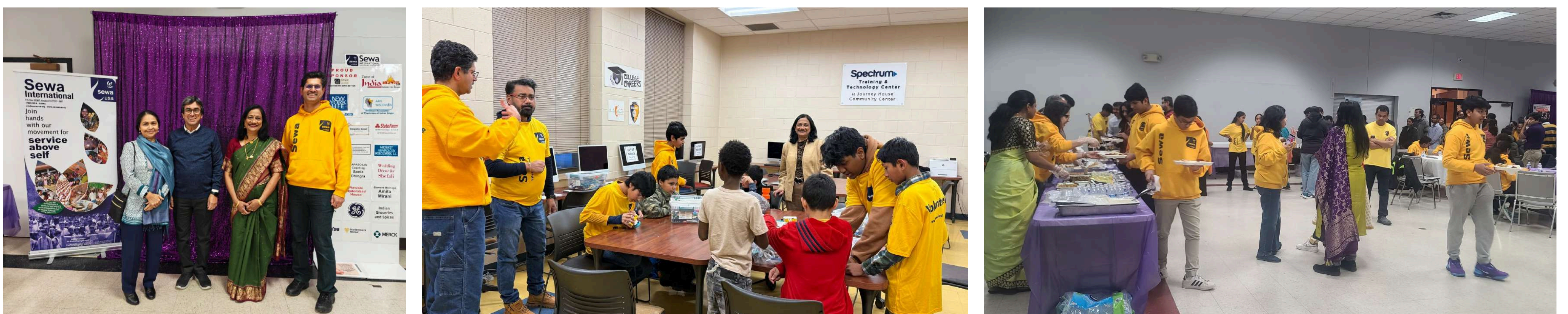
Donors and volunteers strengthened the Sponsor a Child (SAC) engagement in Milwaukee, WI

Consistent communication and building relationships between donors and volunteers in the United States and participating children in India were highlighted as essential ingredients for the Sponsor a Child (SAC) program's success in a recent Sewa Milan (Sewa gathering) organized in Milwaukee, WI.