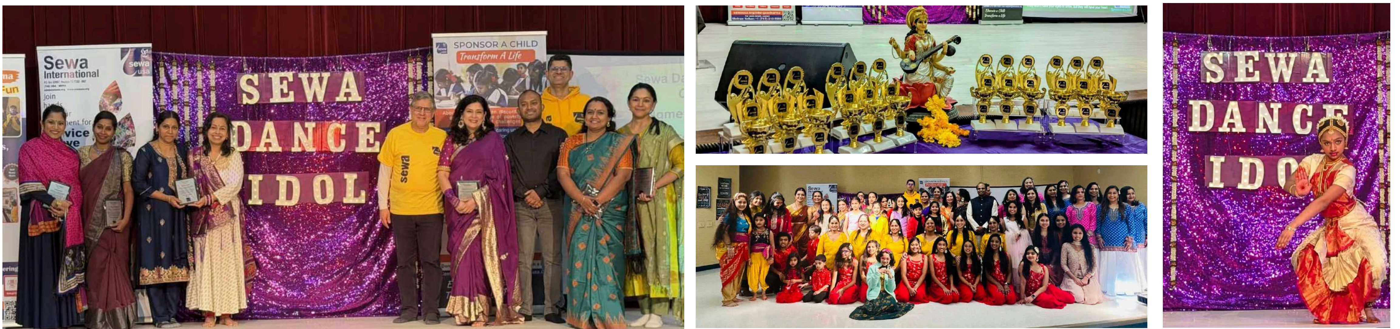
Dance event enabled about 24 student sponsorships in Milwaukee & Madison, WI

A regional dance competition titled “Sewa Dance Idol” in Wisconsin raised funds to support 24 students under Sewa’s Sponsor a Child (SAC) initiative. Organized in Milwaukee and Madison in the first week of March, the dance events drew over 900 attendees. Multiple dance genres, such as Classical, Semi-Classical, Folk, and Bollywood, attracted 290 dancers from several dance schools and troupes. Sewa distributed 260 trophies to the winners in various categories, and several dance teachers helped Sewa evaluate the dancers’ performances. More than 20 volunteers managed event operations and concessions at the dance event.