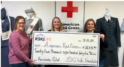
Together, agents, members, and the KSKJ Life Foundation raised $22,845 for the American Red Cross to support 2024 hurricane relief efforts.

Our mission is to provide financial security to our members and their families through our life insurance and annuity products and to make a difference by reinvesting back into our communities.