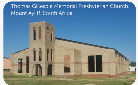
Thomas Gillespie Memorial Presbyterian Church, Mount Ayliff, South Africa