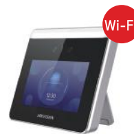
DS-K1T331W Face Recognition Terminal