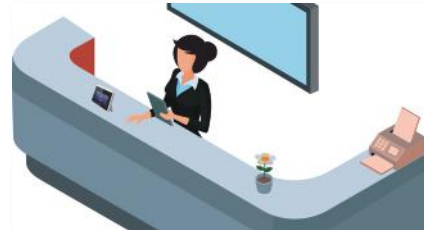
Punch-in / out on company reception desk