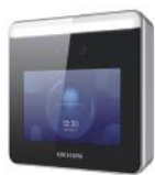
DS-K1T331 Face Recognition Terminal