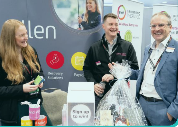
Exhibit the right way

The right audience and the perfect opportunity to shout about your business