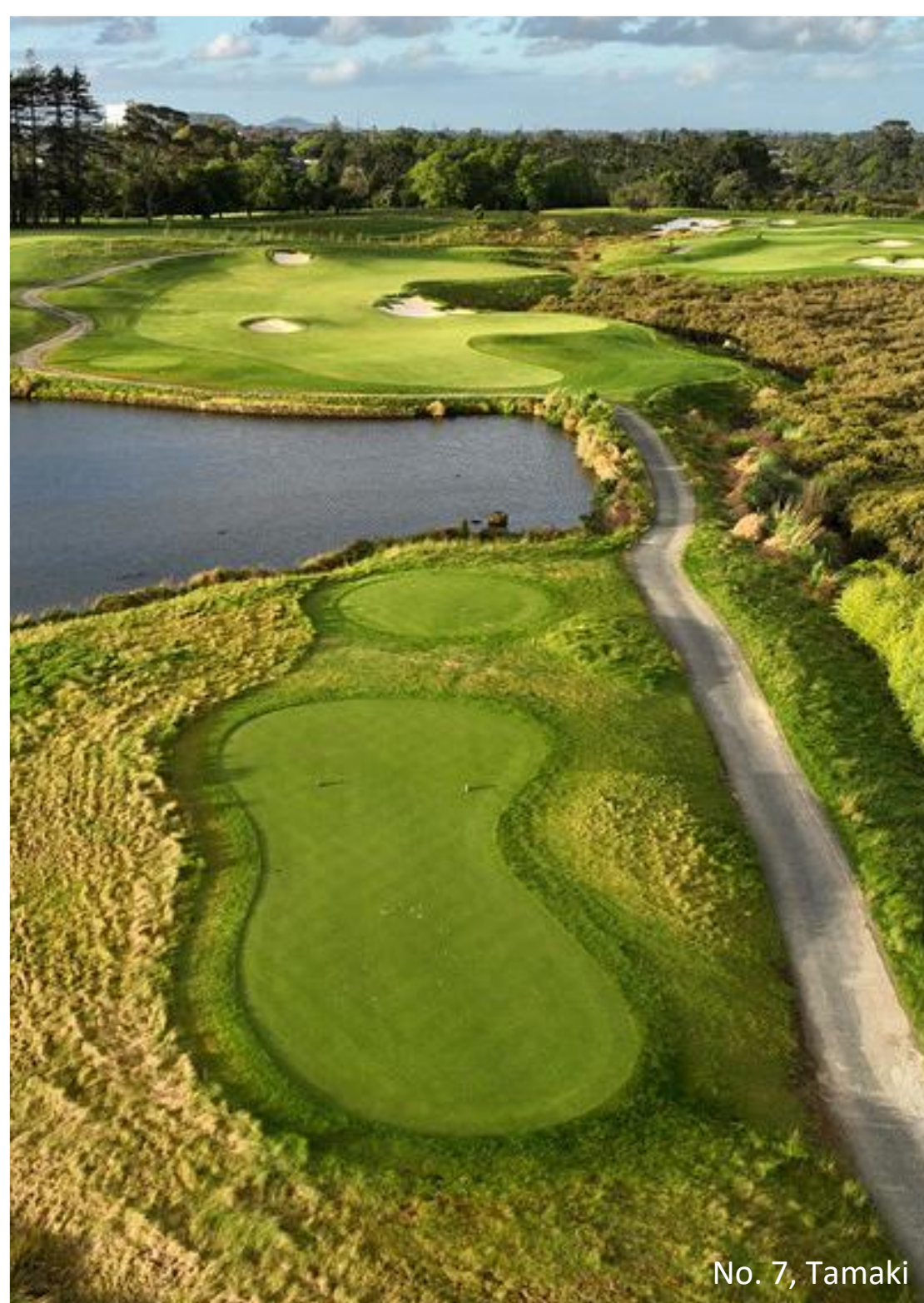
No. 7, Tamaki