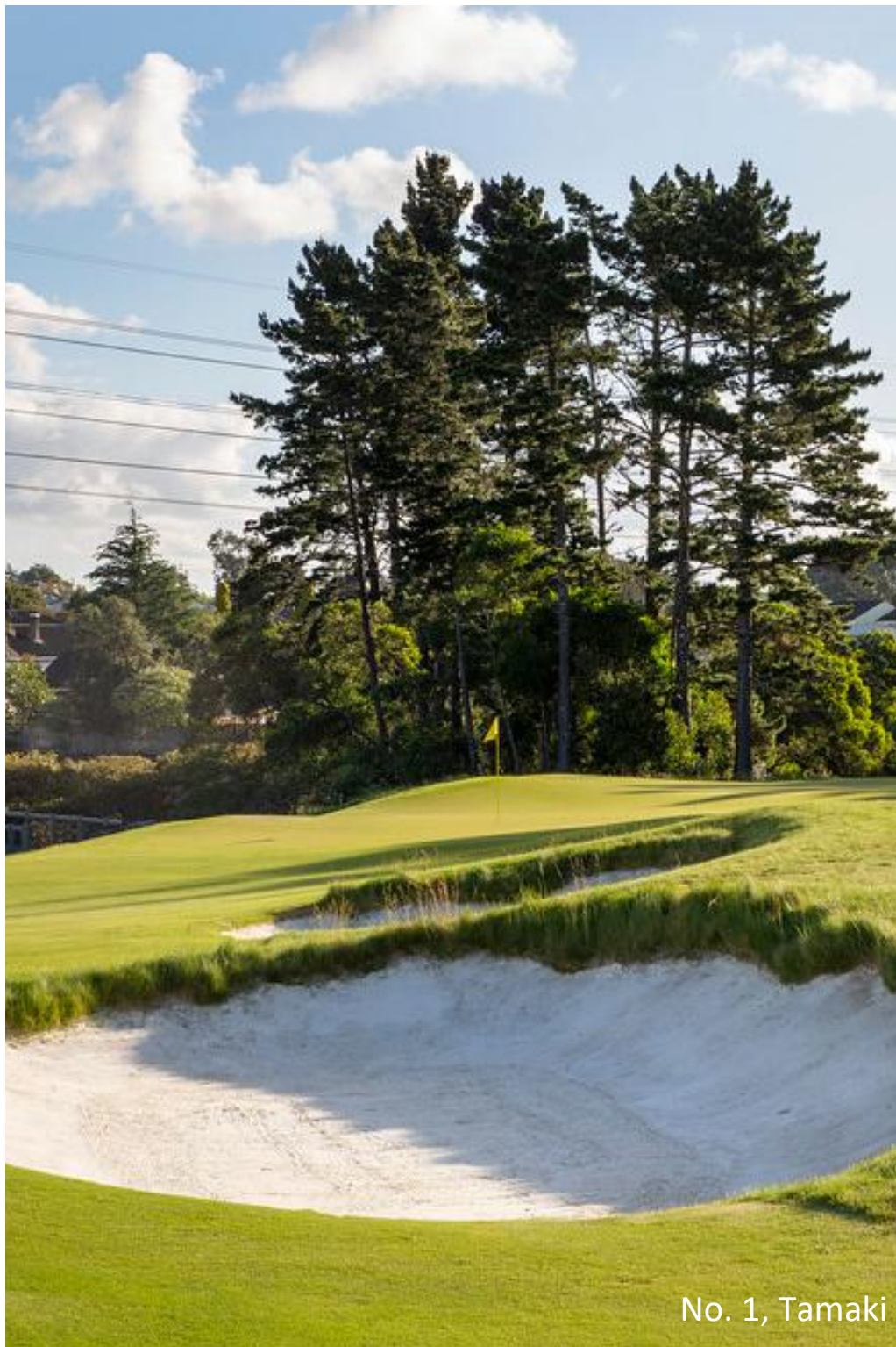
No. 1, Tamaki