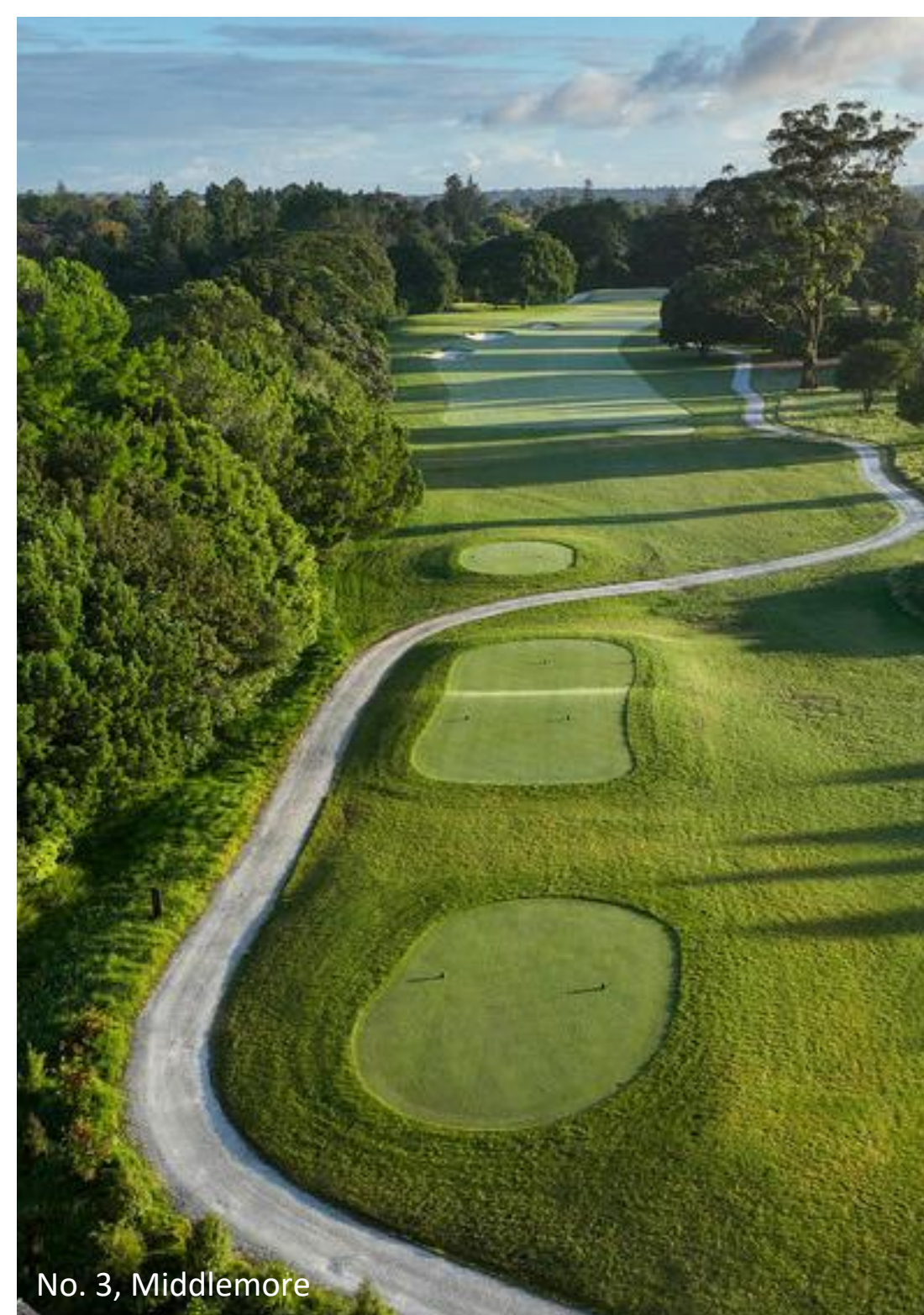
No. 3, Middlemore