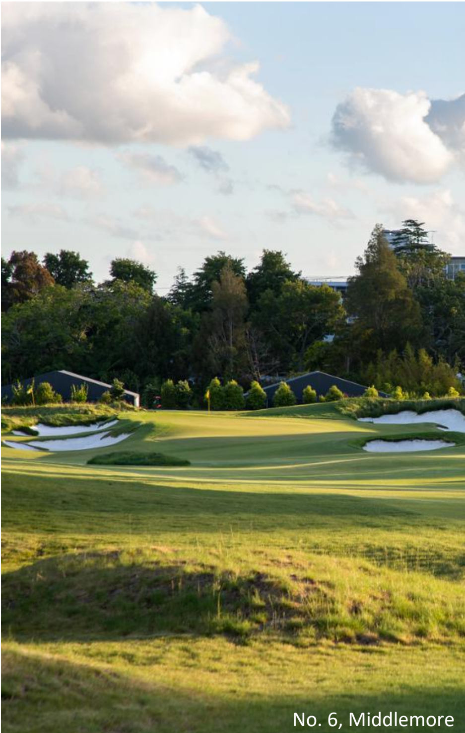
No. 6, Middlemore