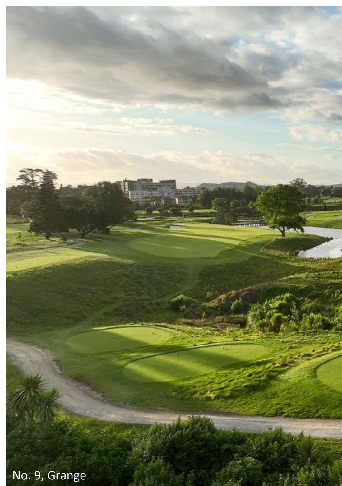
No. 9, Grange