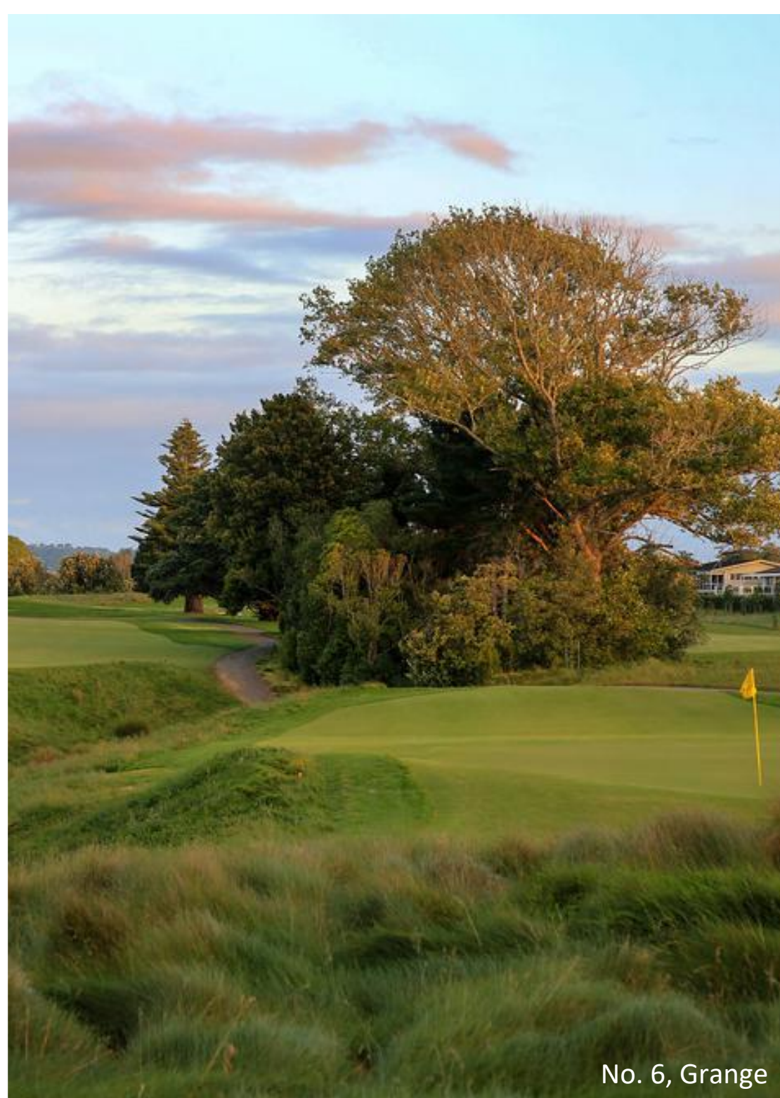
No. 6, Grange