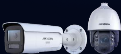
2/3/7 Line IP Camera and PTZ Camera with AcuSearch