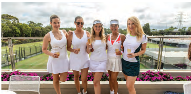
► Top 2022 Day on the Clay, post event drinks on the terrace.