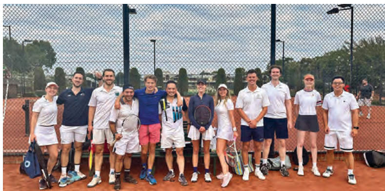
▼ Young Members committee at 2022 Day on the Clay.

Space is limited for Day on the Clay, Young Members Long Lunch and YarraYong ball so early booking is suggested to avoid disappointment.