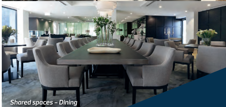
Shared spaces – Dining

Hester Canterbury 9 Chatham Road, Canterbury Victoria