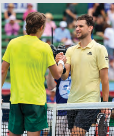
▲ Left Bulgarian top player, Grigor Dimitrov.