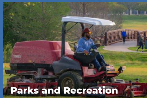
Parks and Recreation