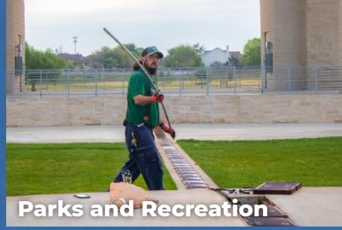
Parks and Recreation