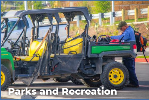
Parks and Recreation