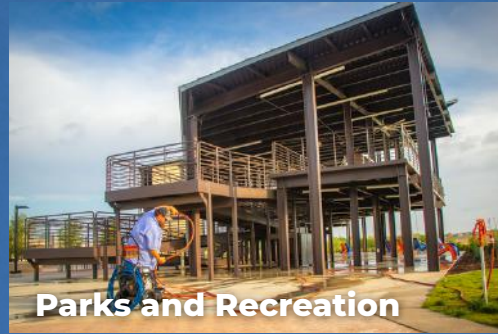
Parks and Recreation