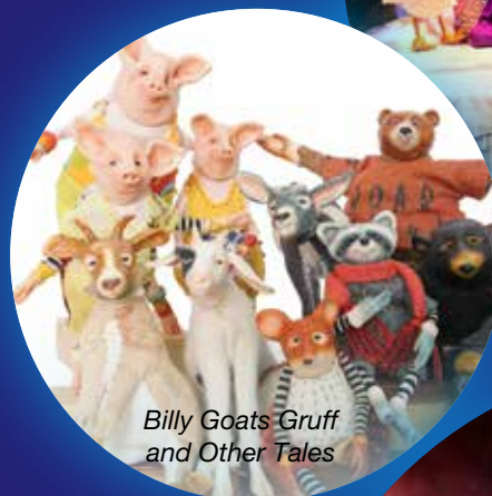
Billy Goats Gruff and Other Tales

Arkansas Learning Standards: Language Arts: K.RC.8-12.RL, K.RC.1-3.RF; 1.RC.1-3.RF, 1.RC.7-12.RL, 1.CC.1-3.P; 2.RC.1-3.RF, 2.RC.7-12.RL, 2.CC.1-2.OL; 3.RC.1-2.RF, 3.RC.7-8.RL, 3.CC.1-2.OL; 4.RC.1-2.RF, 4.RC.7-11.RL, 4.CC.1-2.OL, World Languages: CLT.1.1-2, CLT.2.1, CNN.2.1, CMP.1.1, CMN.1.1 Fine Arts Theatre: RE.7.1 and 2, RE.8.1 RE.8.2, RE.9.1, CN.10.1, CN.11.1, CN.11.2. Musical Theatre: RE.7.1, RE.7.3, RE.7.4, RE.8. Theatre Appreciation: RE.7-9, CN.11. Music: RE.7-9, CN.10, CN.11. Music Appreciation: RE.7-9, CN.10, CN.11. Visual Art: RE.7-9, CN.10, CN.11.