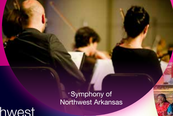
Symphony of Northwest Arkansas