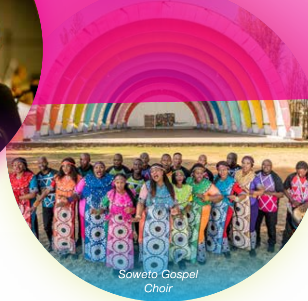
Soweto Gospel Choir

Arkansas Learning Standards: Fine Arts Music: PR.4, RE.7, 8 and 9, CN.10 and 11. Vocal Ensemble: RE.7, 8 and 9, CN.10 and 11. Instrumental Ensemble: RE.7, 8 and 9, CN.10 and 11. Music Appreciation: PR.4, RE.7, 8 and 9, CN.10 and 11. Music Technology: RE.7 and 8. Theatre Appreciation: PR.4, RE.7-9, CN.10, CN.11.