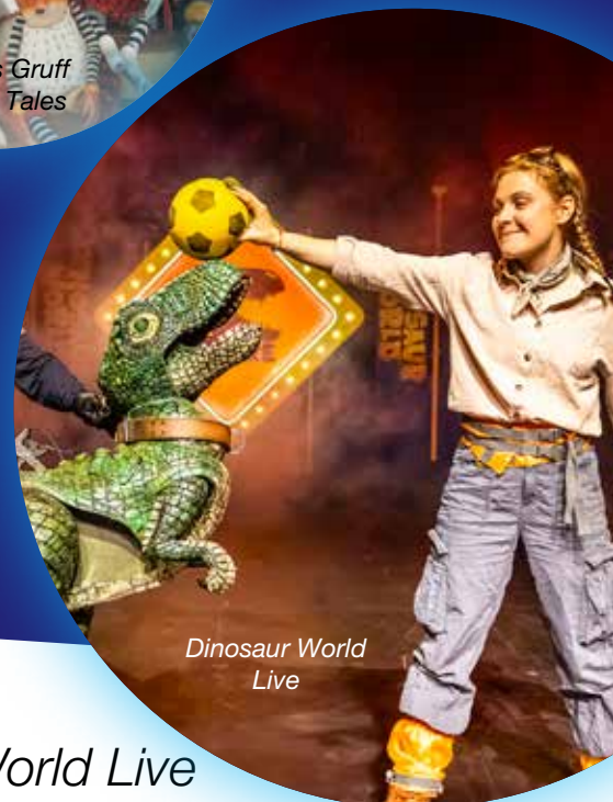
Dinosaur World Live