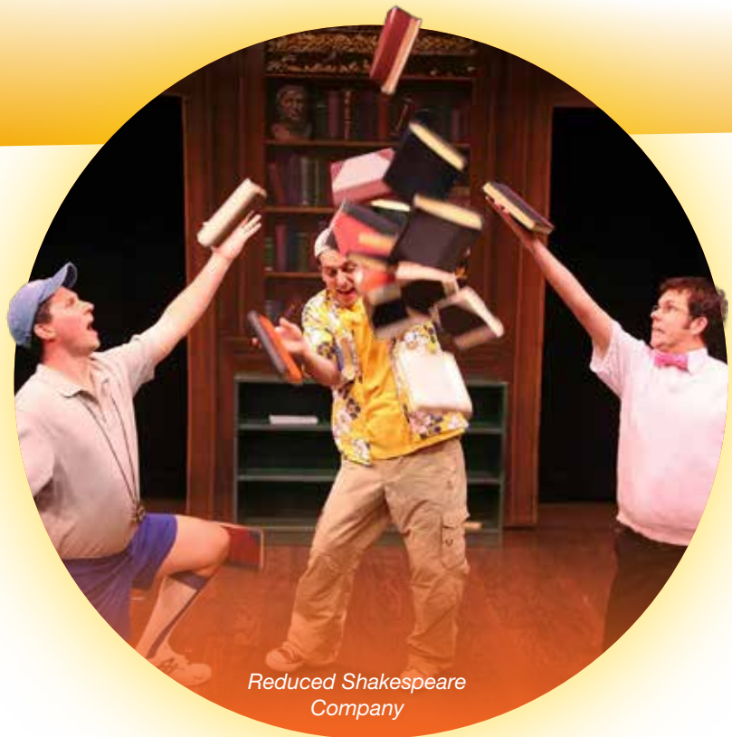
Reduced Shakespeare Company

Arkansas Learning Standards: English Language Arts: 6.RC.10.RL, 6.CC.7.SLC, 7.RC.6.RL, 7.RC.8.RL, 7.RC.10.RL, 7.CC.4.SLC, 8.RC.5.RL, 8.CC.4.SLC, 9.RC.4.RF, 9.V.5, 9.CC.6.SLC, 10.RC.6.RL, 10.RC.7.RL, 10.V.5, 10.CC.6.SLC, 11.RC.5.RL, 11.RC.8.RL, 11.V.2, 11.CC.6.SLC, 12.RC.5.RL, 12.RC.7.RL, 12.V.2, 12.CC.6.SLC. Fine Arts Theatre: CR.3.1, PR.4.1, RE.7.1 and 2, RE.8.1 and 2, RE.9.1, CN.10.1, CN.11.1 and 2. Theatre Appreciation: PR.4, RE.7-9, CN.10, CN.11.