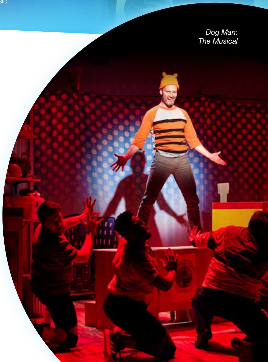
Dog Man: The Musical

Arkansas Learning Standards: English Language Arts: 2.RC.1-3.RF, 2.RC.7-12.RL, 2.CC.1-2.OL, 2.CC.3.P, 2.CC.5.P; 3.RC.1-2.RF, 3.RC.7-8.RL, 3.CC.1-2.OL, 3.CC.3.P; 3.CC.5.P. Fine Arts Standards Theatre: RE.7.1 and 2, RE.8.1 and 2, RE.9.1, RE.9.2, CN.10.1, CN.11.1 and 2. Musical Theatre: RE.7.1, RE.7.3, RE.7.4, RE.8. Theatre Appreciation: PR.4, RE.7, 8 and 9, CN.10 and 11. Music: RE.7, 8 and 9, CN.10, CN.11.