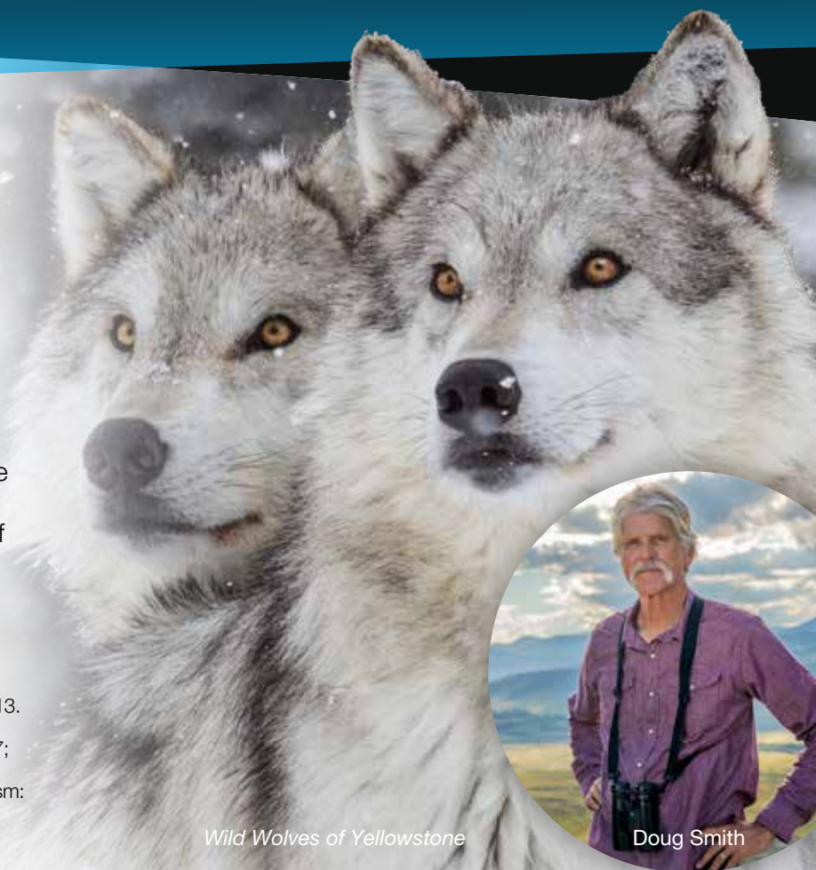
Wild Wolves of Yellowstone

Arkansas Learning Standards: English Language Arts: 3.RC.13. RI; 3.RC.17.RI; 4.RC.14.RI; 4.RC.17.RI; 5.RC.14.RI; 5.RC.17.RI. Social Studies: C.1.3.9; C.1.4.9; G1.3.4; G.1.4.4; G.1.3.7; G.1.4.7; H1.3.3; H1.4.3; H.1.4.5; H.1.4.7; G.2.5.6 and 8; G.3.5.1; G.3.5.9; G.3.4.5.2; G.1.6.4; G.1.5.1; H.3.7.15; H.4.8.10; H.4.8.14. Journalism: H.2.JI.1; H.2.JI.3; MO.3.JI.4; W.5.JI.6; PH.6.JI.5; P.7.JI.1.