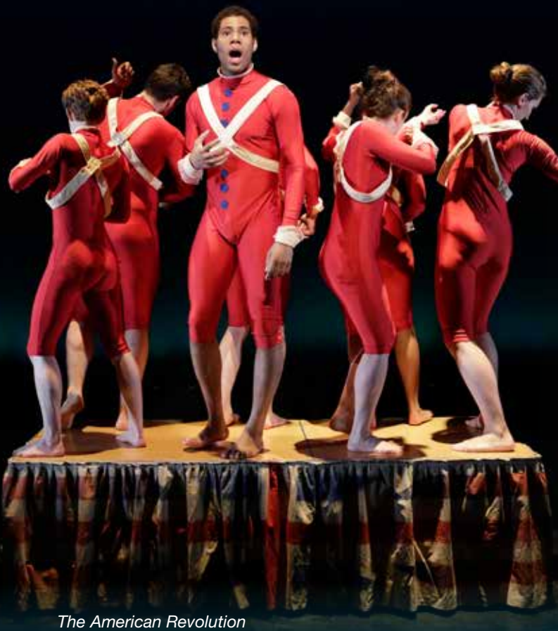
The American Revolution