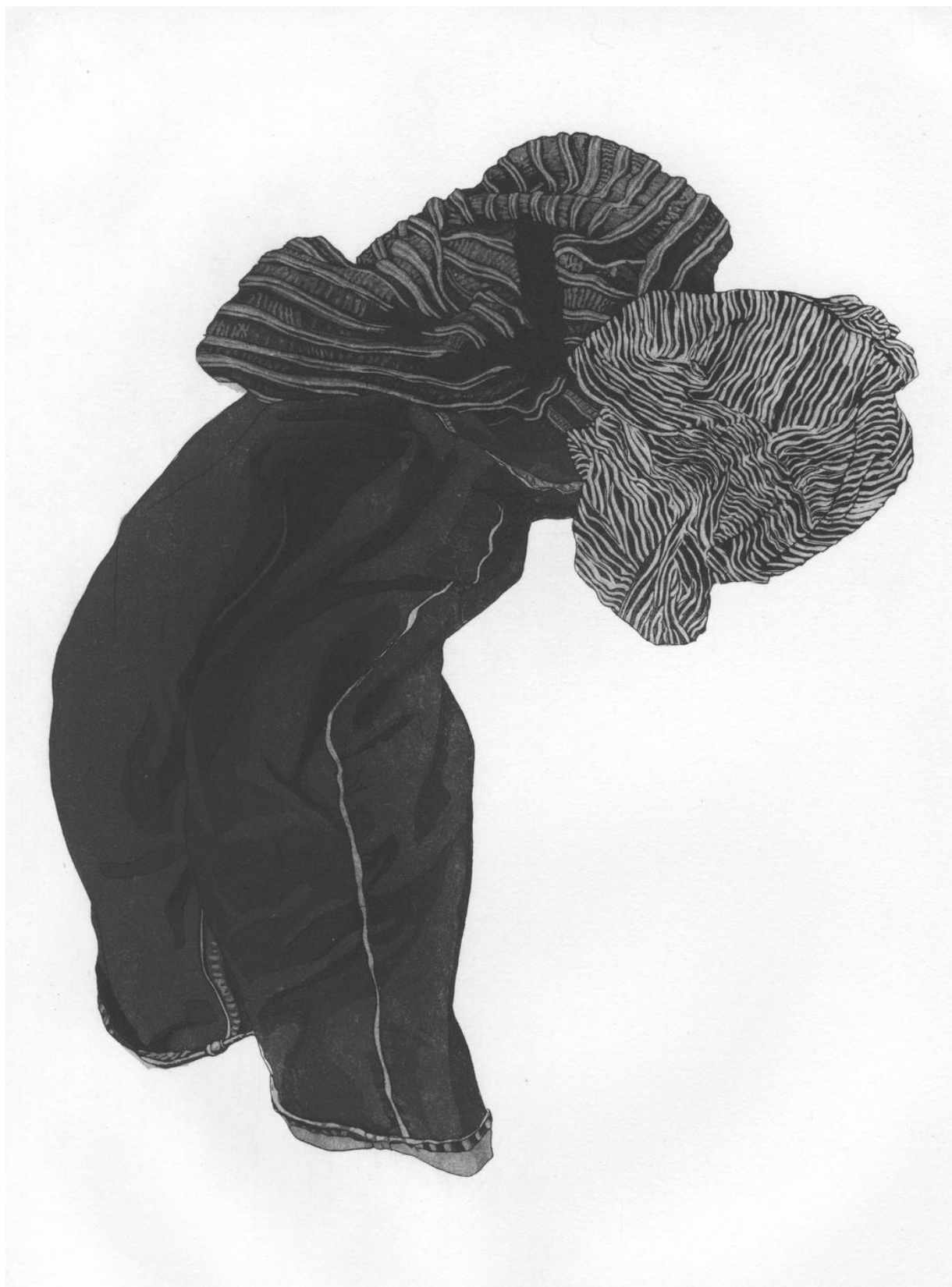
In the Course of Time 3 , Aquatint etching with spit bite, 15 x 18 inches ($300)