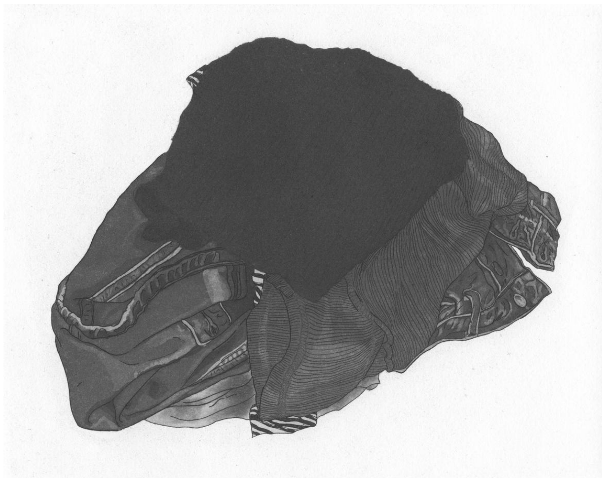
In the Course of Time 2 , Aquatint etching with spit bite, 18 x 15 inches ($300)