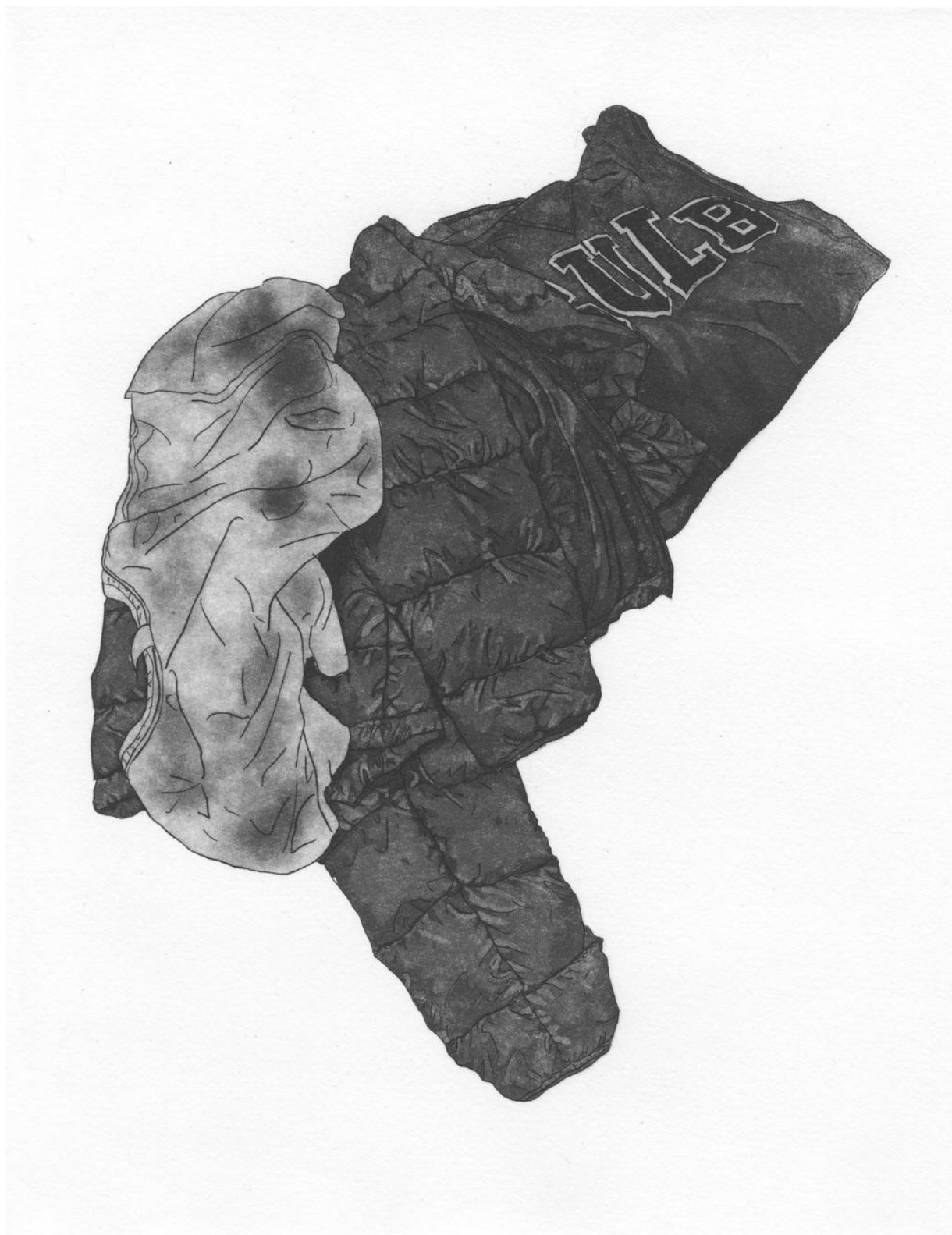
In the Course of Time I , Aquatint etching, 15 x 18 inches ($300)