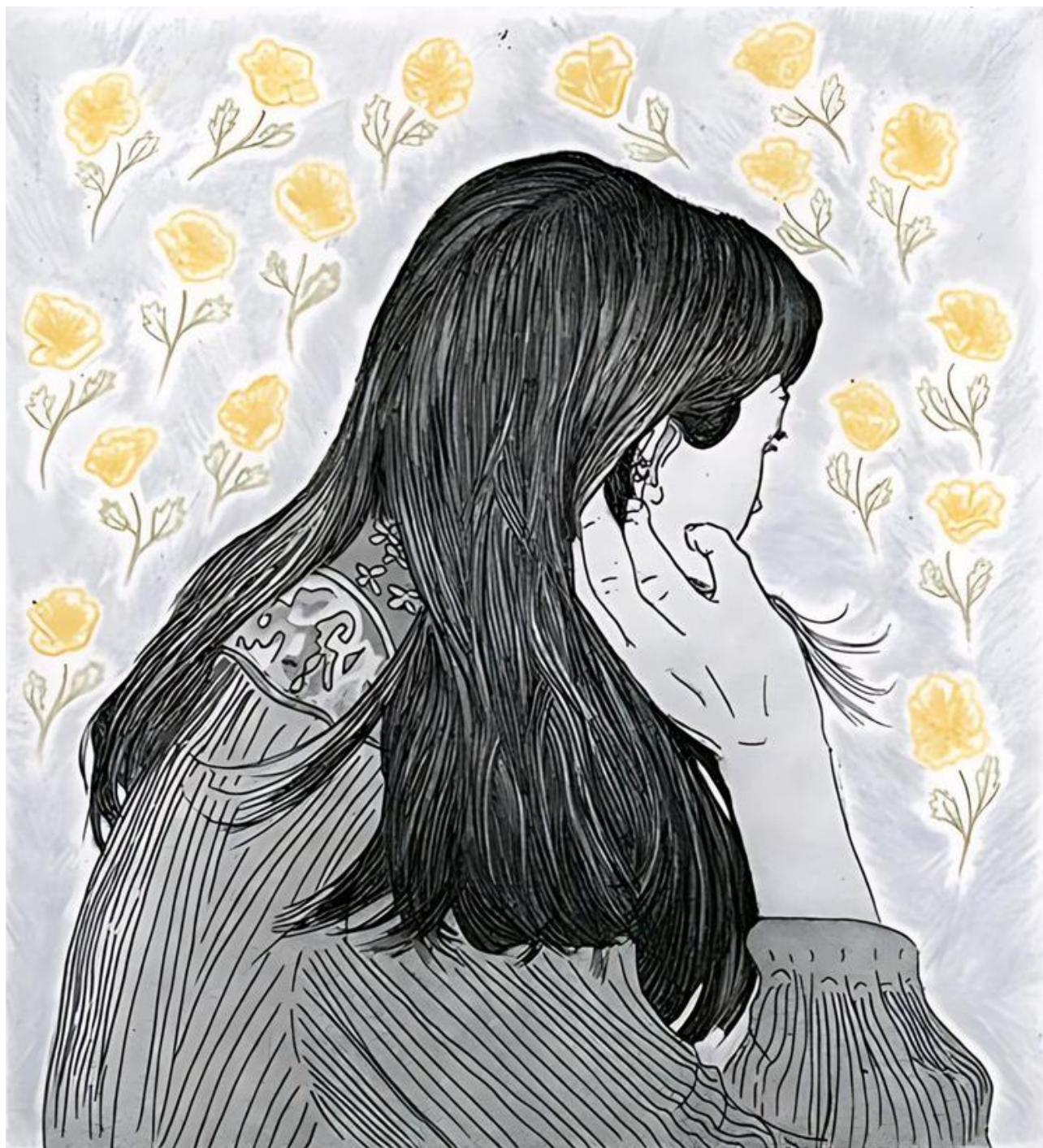
Sonder , Aquatint etching with hand embellishing, 10 x 10 inches ($300)