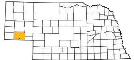
CHEYENNE COUNTY, NE

A total of 80.12± acres dryland with 78.62± acres being farmed. 3.5 miles south of Sidney in Cheyenne County, Nebraska. Possession upon closing-currently in corn stalks and wheat stubble. Seller to convey all OWNED minerals.