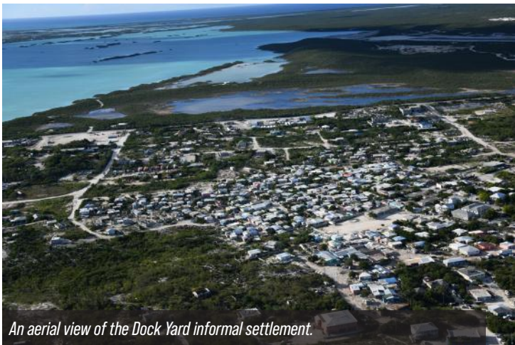
An aerial view of the Dock Yard informal settlement.

The ISU announced on November 20, 2023 that they would put a temporary pause on all reclamation exercises scheduled through the end of 2023 until at least January of 2024.