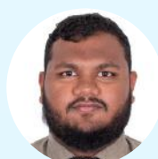
VICE SECRETARY GENERAL