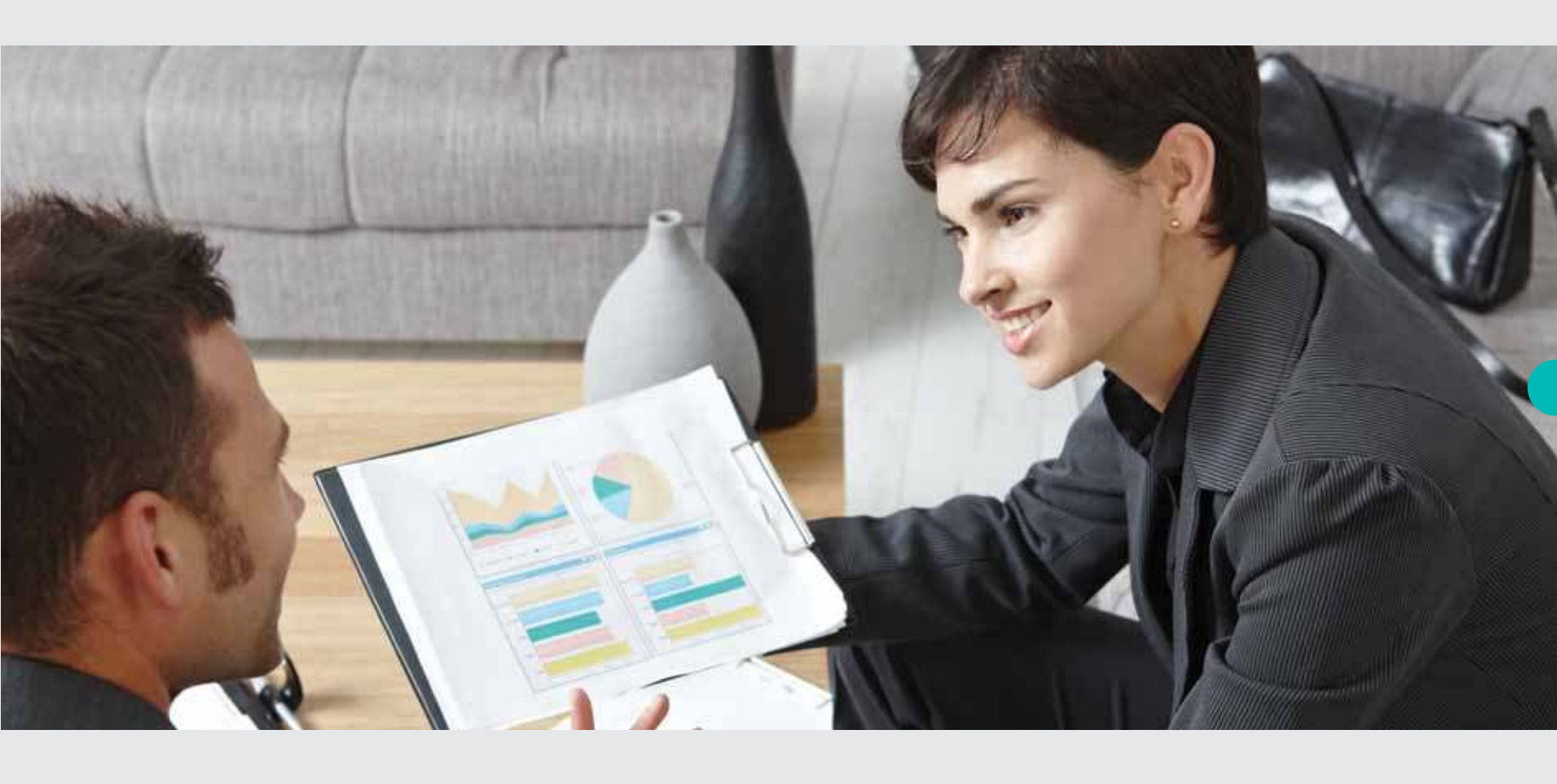
STEP 4 Appraise Outcomes