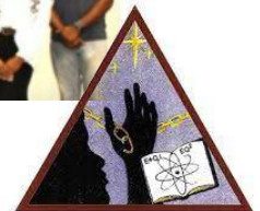
NATIONAL ACHIEVERS SOCIETY