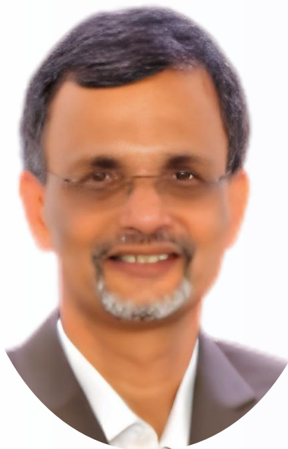
Dr V. Anantha Nageswaran

Chief Economic Advisor Government of India