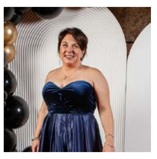
focused culture that meets service standards.

Ensure a safe, inclusive, and compliant workplace in line with WHS, EEO, and environmental regulations.