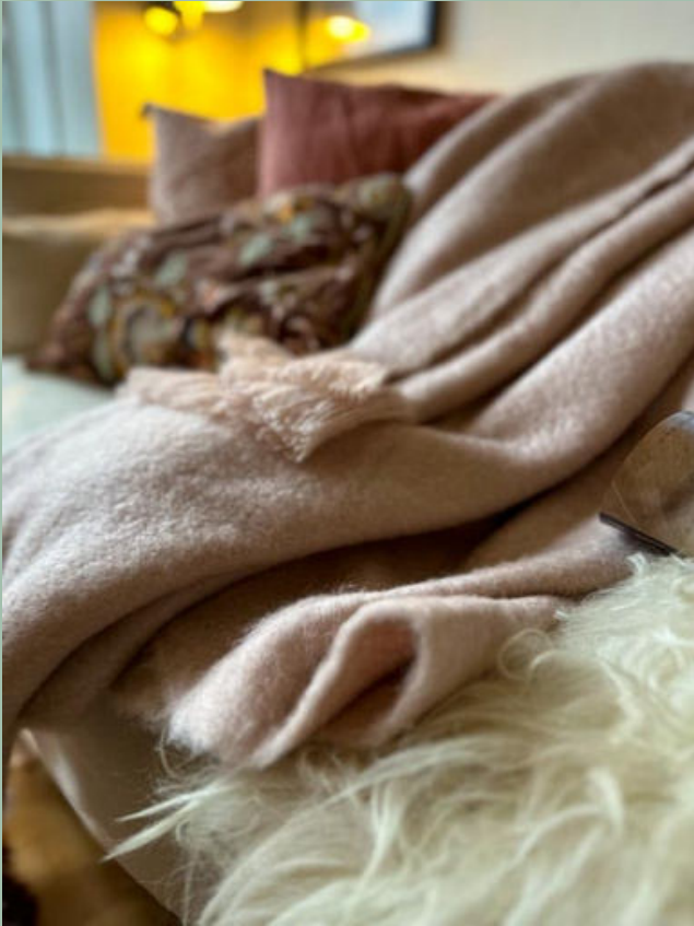
ROSE WINTER PLAID