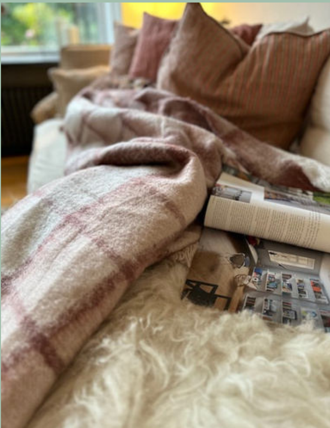
WINE ROSE WINTER PLAID