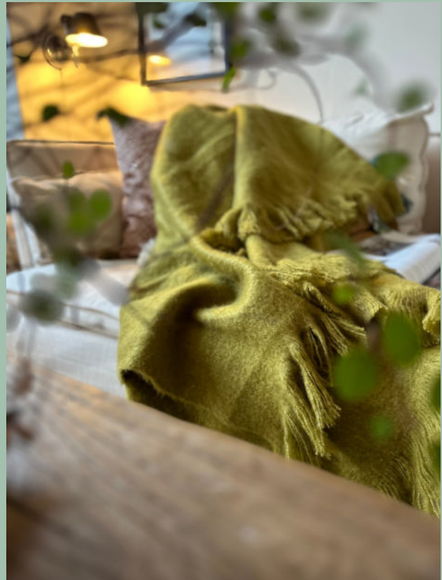
OLIVE WINTER PLAID