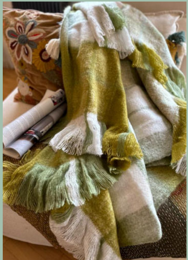
SAGE OLIVE WINTER PLAID