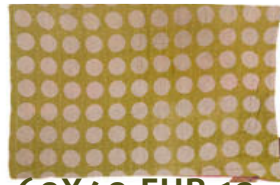
60X40 EUR 12