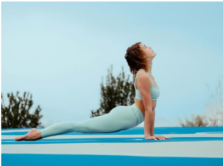
ROOFTOP AMENITY WITH YOGA, FITNESS STUDIO AND PICKLEBALL COURT