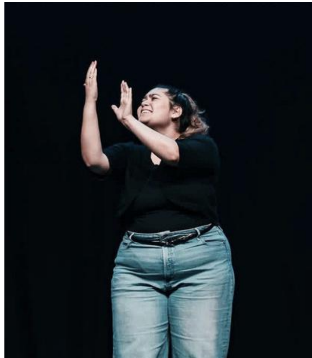
interpreting services in American Sign Language (ASL)

What excites me most is the opportunity to connect with other interpreters and continue learning from their experiences. I am looking forward to stepping even further outside of my comfort zone and growing both personally and professionally. When I reflect on my journey so far, I realize how far I've already come. It's so important to look back on where you've been, because that's when you can truly see how much you've grown, and that motivates me to keep moving forward. I am thankful for my ASL teachers who laid a solid foundation for me to be able to step outside my comfort zone, keep learning, and build a career doing something I truly care about.