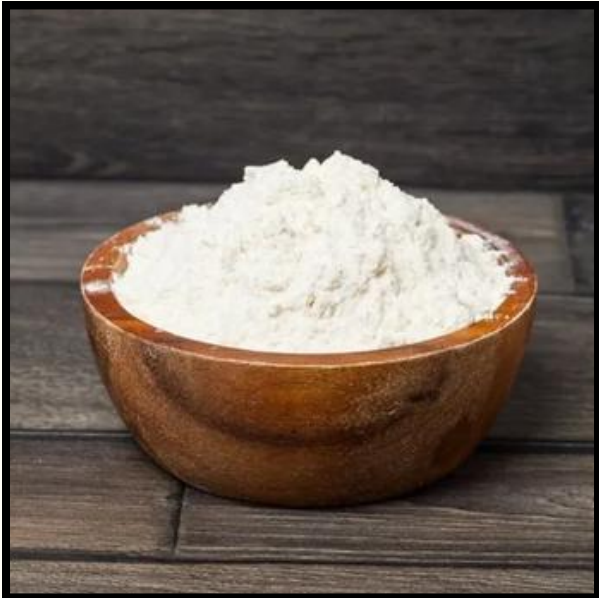
Refined Maida Flour