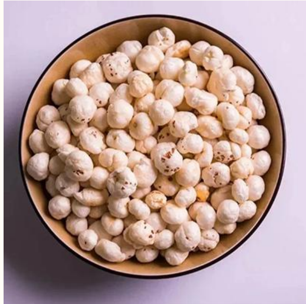
Diamond Premium Makhana