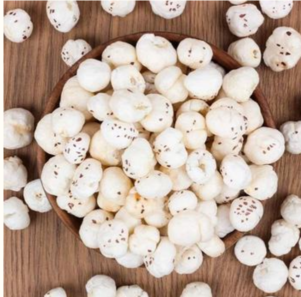
4 Suta Makhana