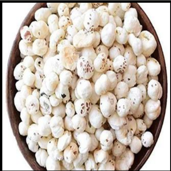
3 Suta Makhana