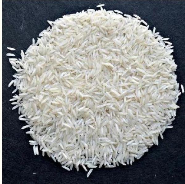
1121 Steam Basmati Rice