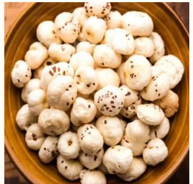
6 Suta Makhana