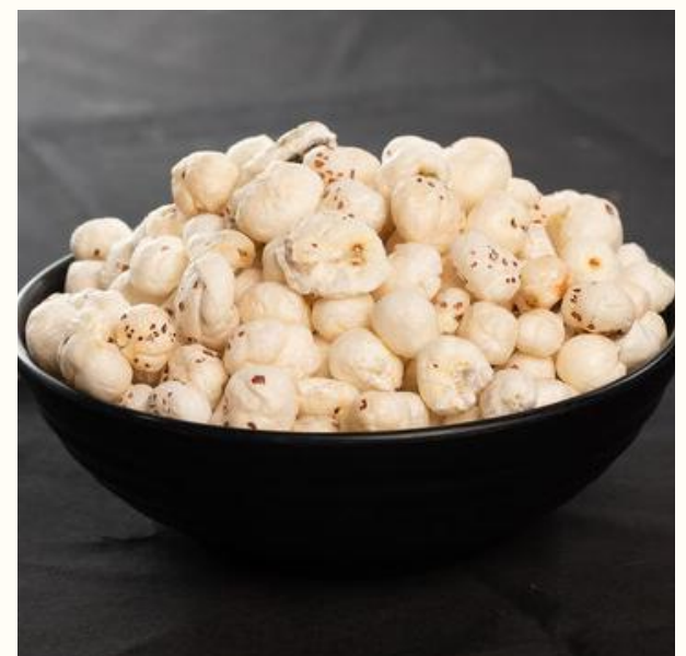
Kanha Gold Makhana