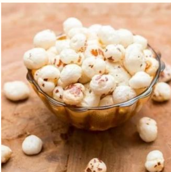
6 Plus Suta Makhana