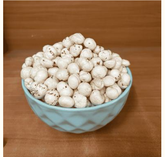
4 Plus Suta Makhana