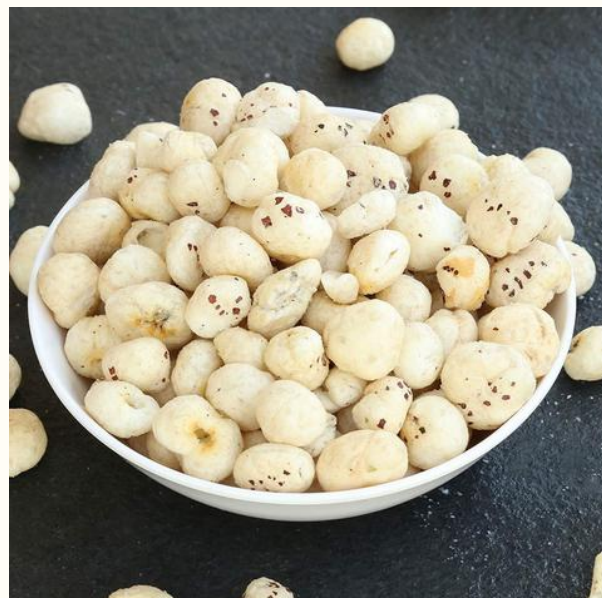
5 Plus Suta Makhana