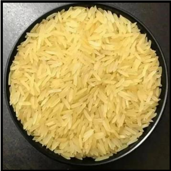
1121 Golden Sella Basmati Rice