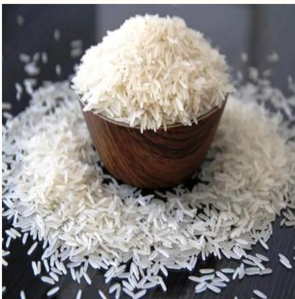
1509 Basmati Rice

Basmati rice is a premium variety of long-grain rice known for its distinctive aroma, delicate texture, and rich flavor. Grown mainly in the Indian subcontinent, especially in regions of India and Pakistan, basmati is a staple in many traditional dishes such as biryani, pulao, and fried rice. Its name means "fragrant" in Hindi, reflecting its naturally aromatic quality that sets it apart from other rice types.