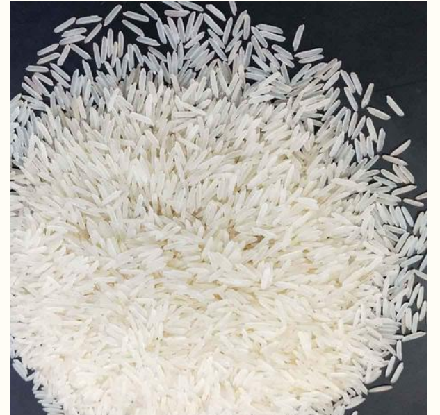
1121 White Sella Basmati Rice