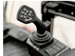
Ergonomic & Serviceable Joystick (Standard)