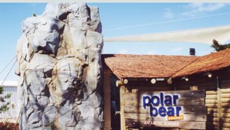
Entrance to Polar Bear Shores, with artificial rock