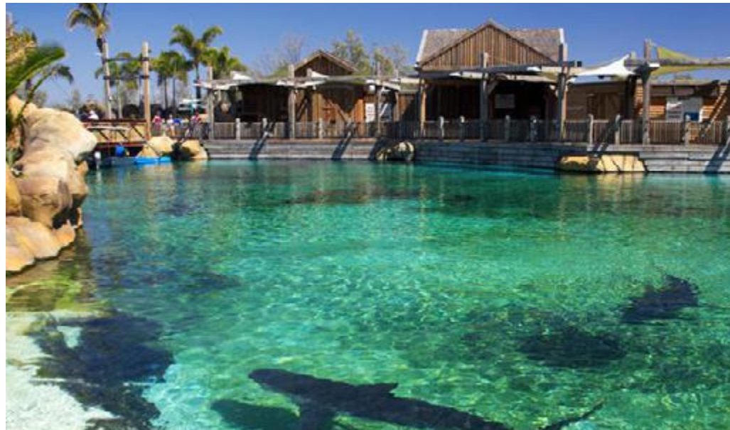
The inviting lagoon...