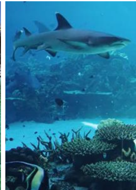
A shark glides above a coral reef