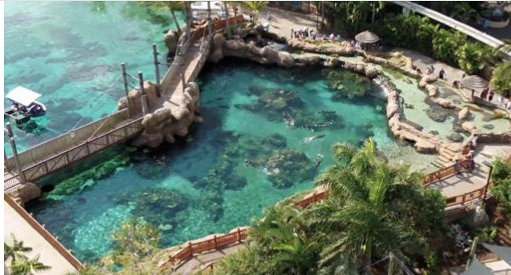
Aerial view of Shark Bay, showing the lagoon