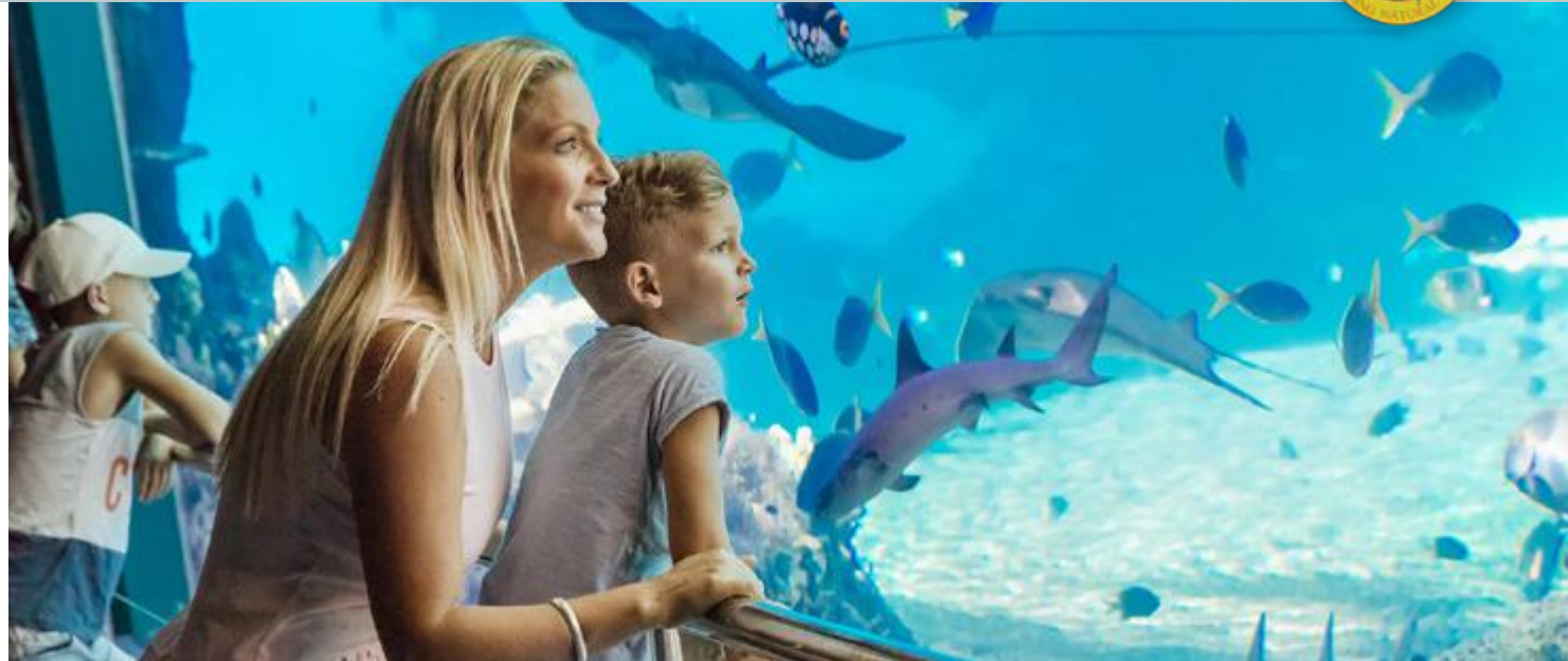
Visitors enjoy the Shark Bay viewing experience