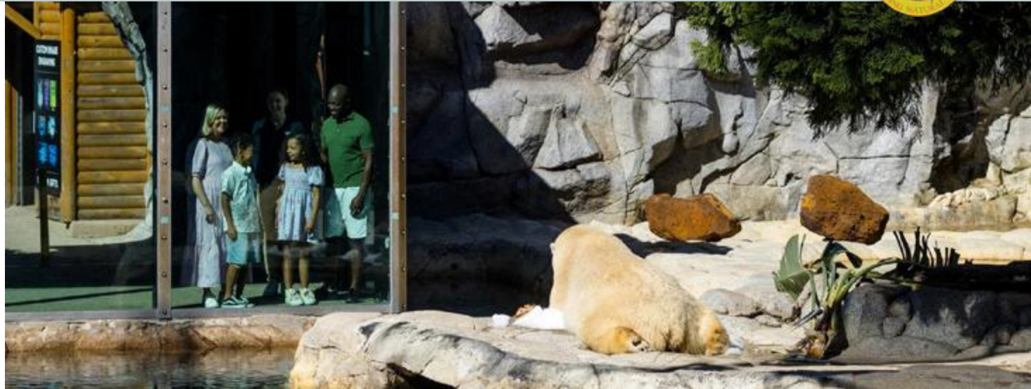
Visitors have a clear view of the polar bears basking on rocks

The artificial rock provides a solid playground for bears to climb and play, and looks real enough to immerse visitors in the Arctic experience.