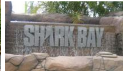
Entrance to Shark Bay