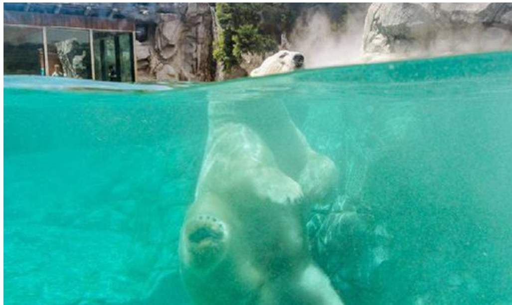
A polar bear enjoys a cool dip in the artificial rock pool