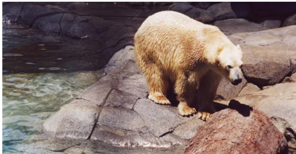
Polar Bear Shores – a polar bear explores its habitat