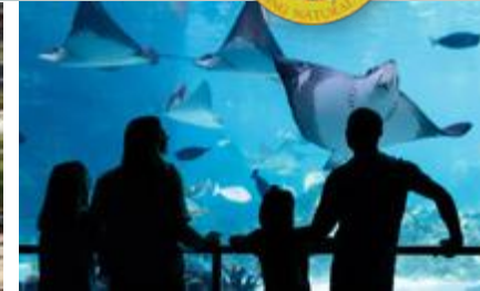
Viewing the aquarium