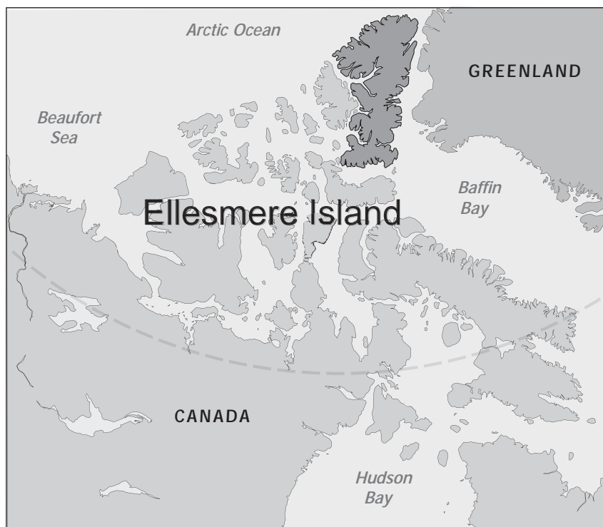
Map I.1 Map of Ellesmere Island.