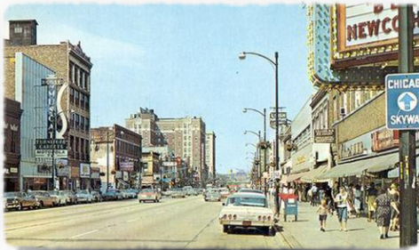
"The Steel City" Broadway Avenue Gary, Indiana Date: Circa 1965 Source Type: Postcard