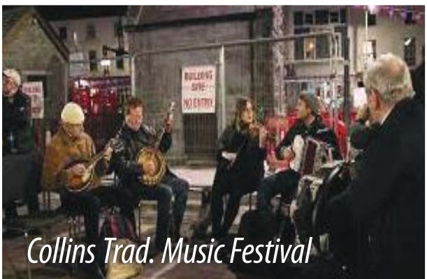
Collins Trad. Music Festival