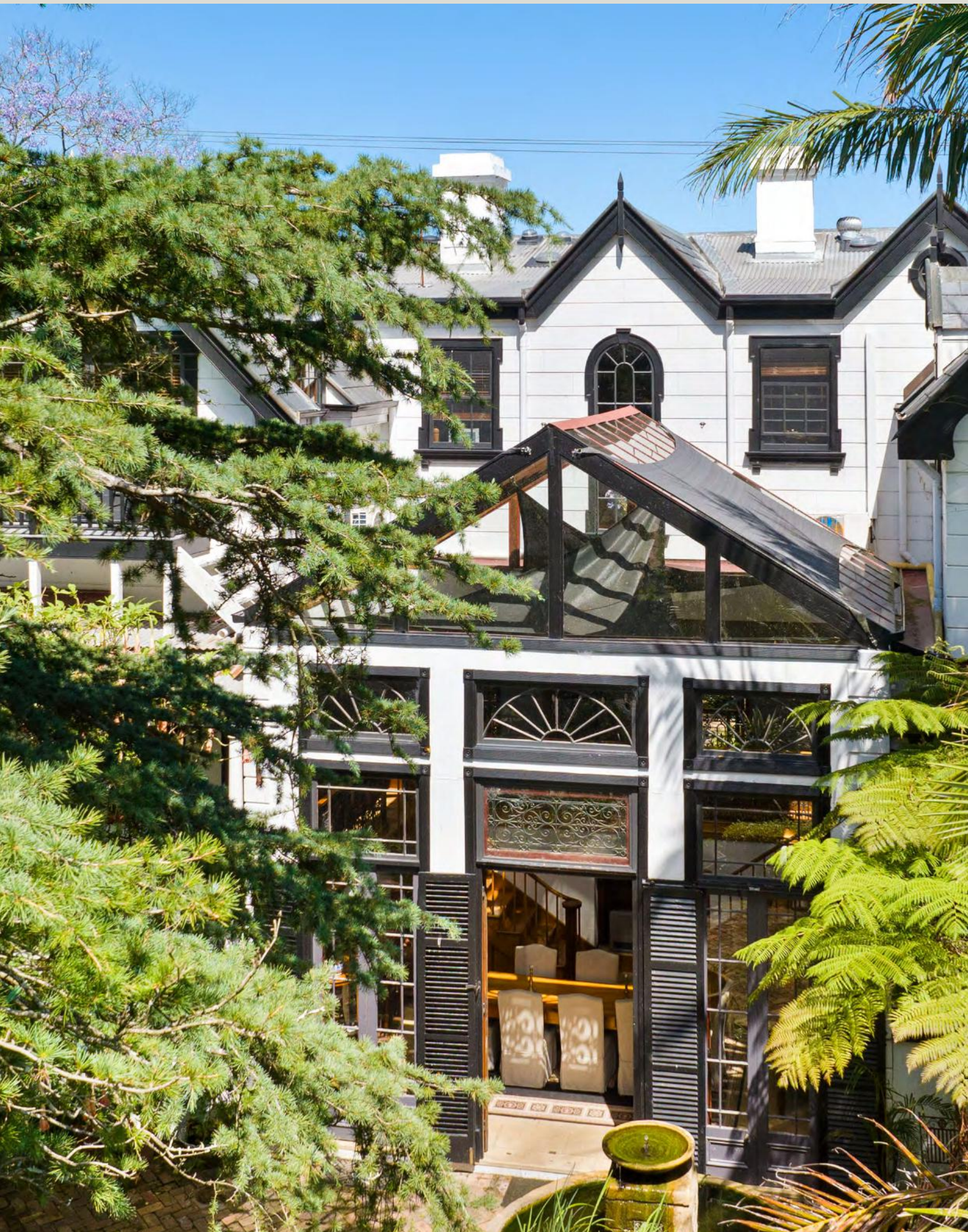
23-25 Regent Street, Maitland, NSW