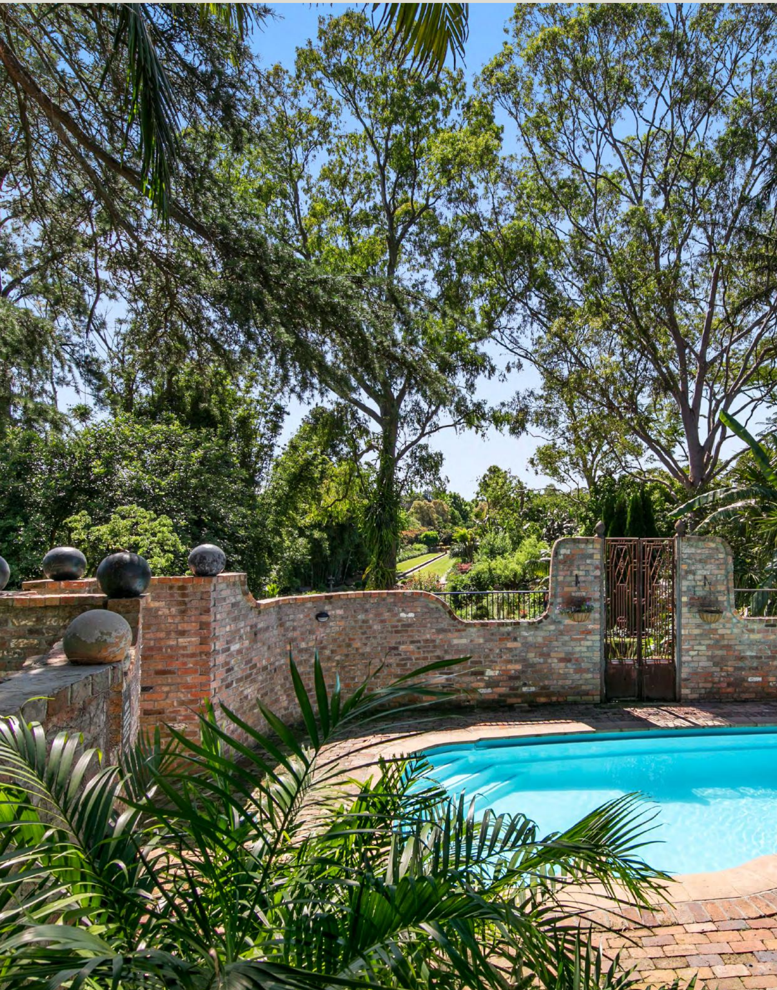
23-25 Regent Street, Maitland, NSW