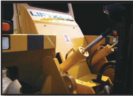
PROTECTION: Fully enclosed and protected electric and hydraulic systems