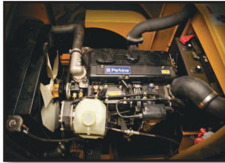
ENGINE: The P Series forklifts have a sliding hood for easy access during maintenance and house a Perkins Turbo Tier 3 emission compliant diesel engine.