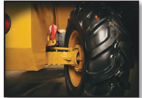
STEERING CONTROL: 4 Wheel steering with tight turning radius and exceptional ground clearance.