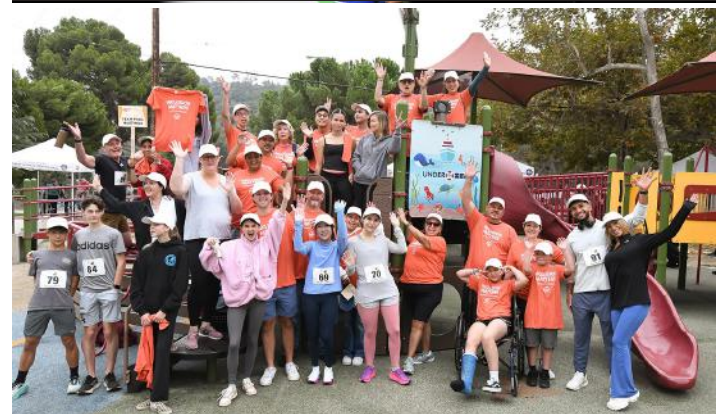
Paul Hastings Run, Walk & Roll Teams