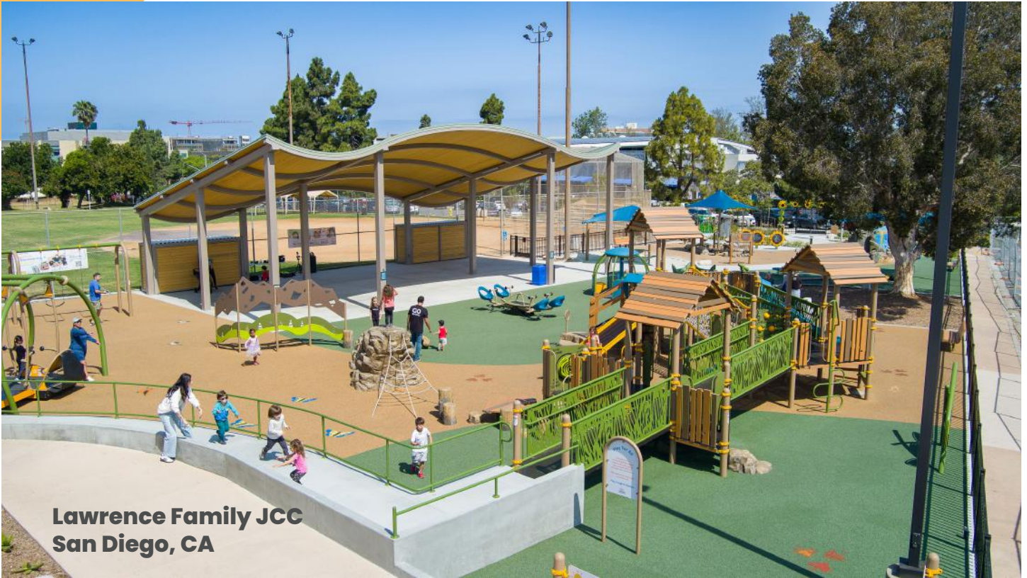
Lawrence Family JCC San Diego, CA