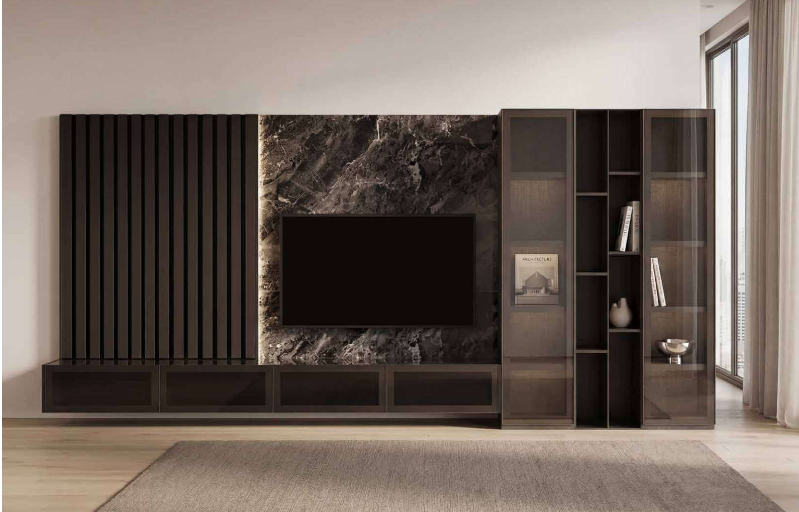
TV UNIT 20