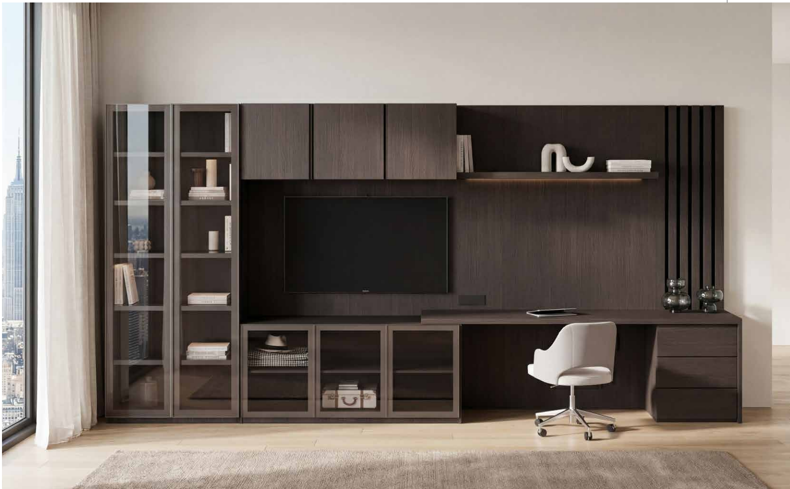
TV UNIT 23