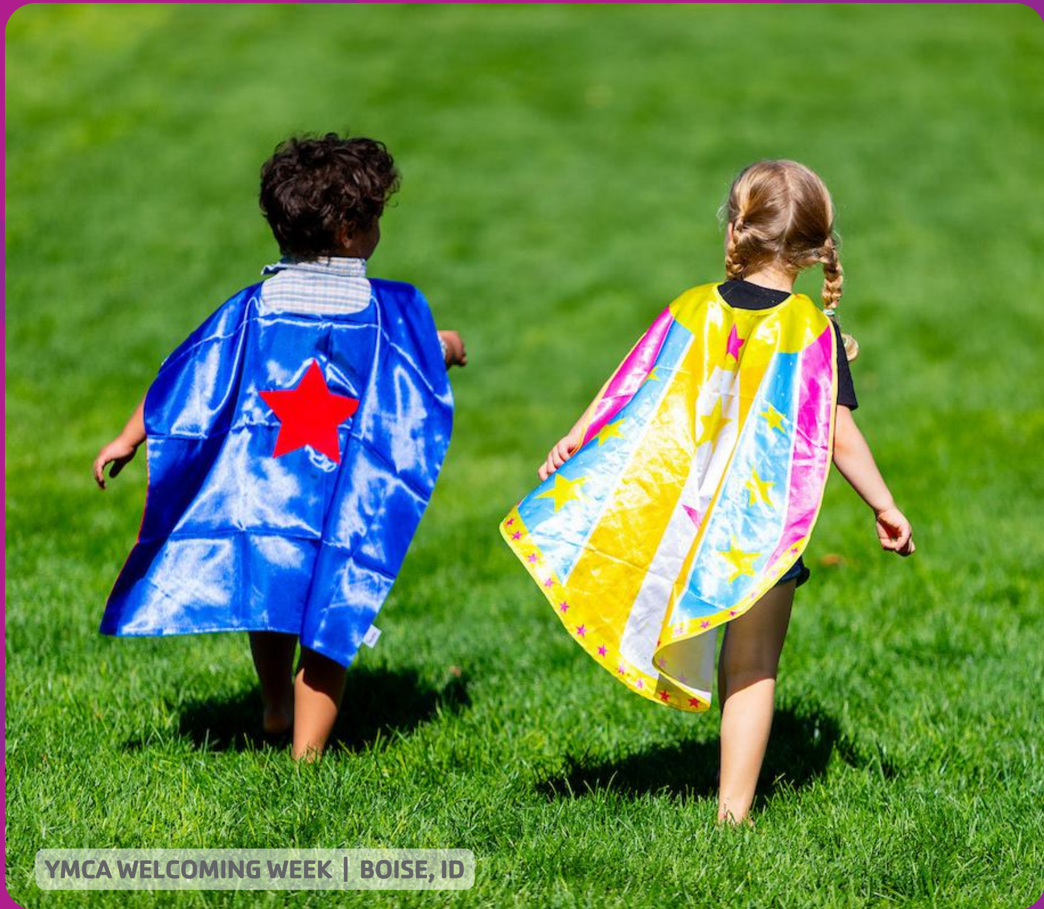
YMCA WELCOMING WEEK | BOISE, ID