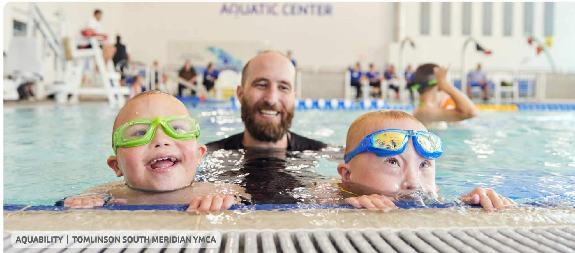
AQUABILITY | TOMLINSON SOUTH MERIDIAN YMCA