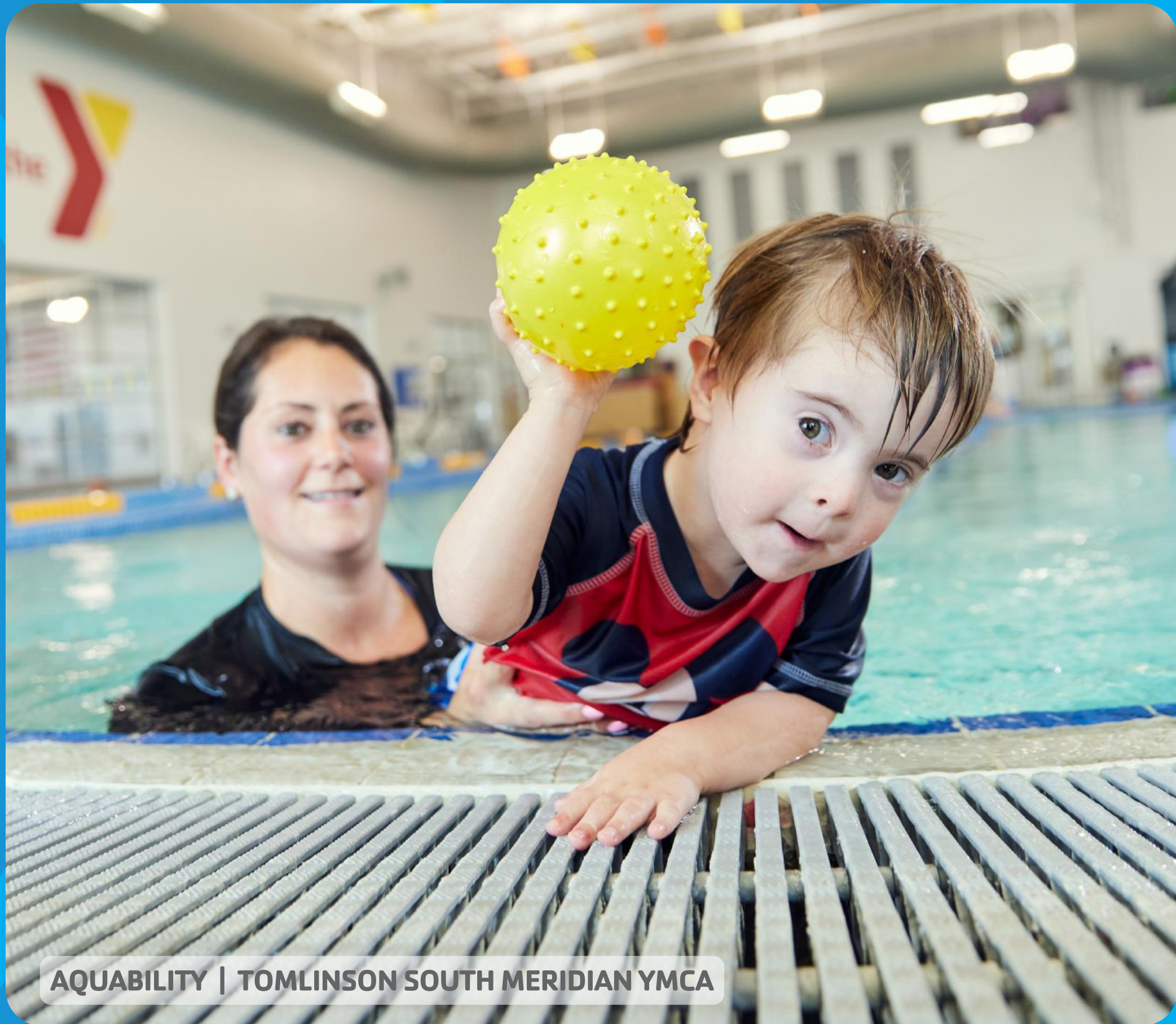
AQUABILITY | TOMLINSON SOUTH MERIDIAN YMCA