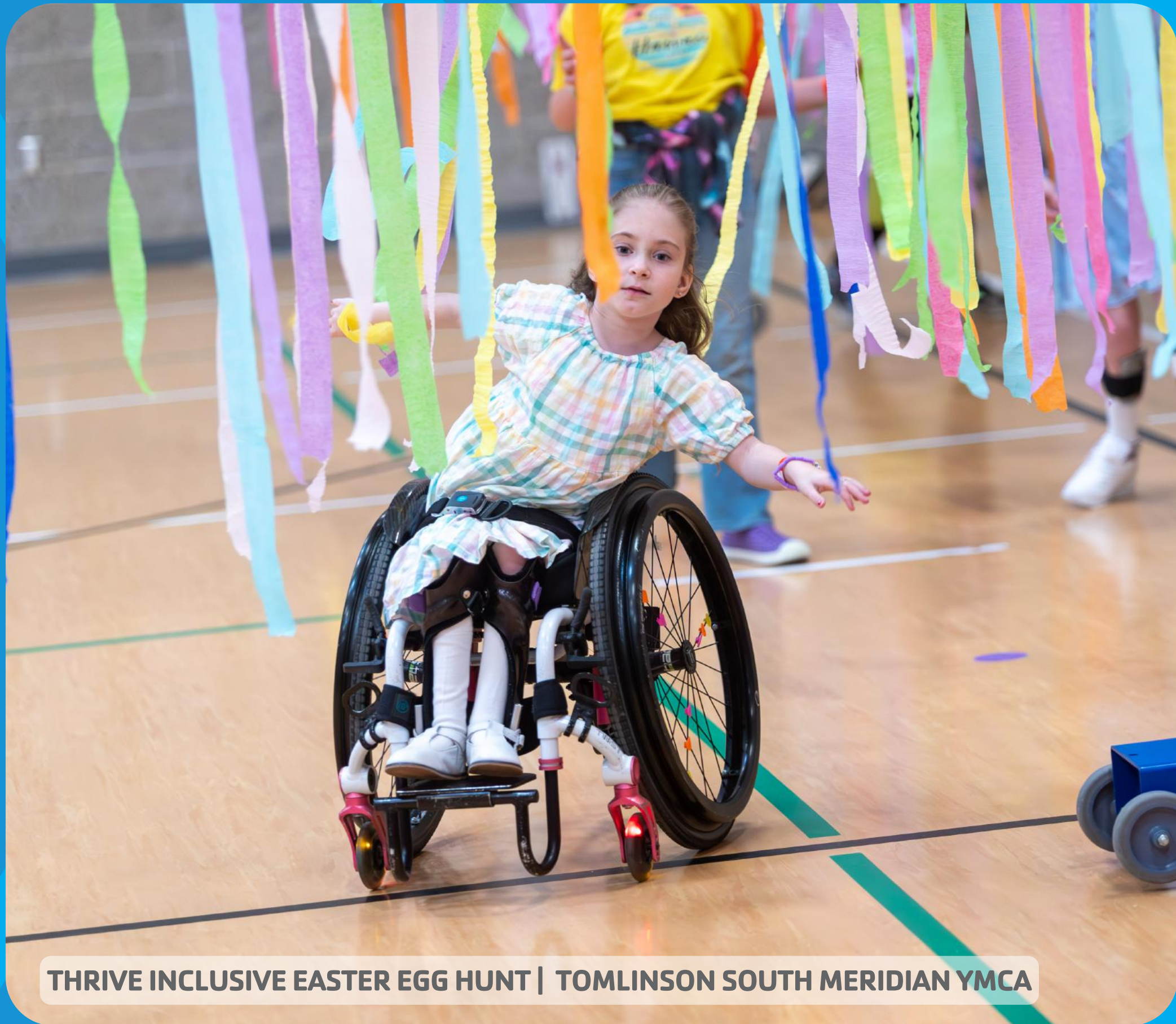
THRIVE INCLUSIVE EASTER EGG HUNT | TOMLINSON SOUTH MERIDIAN YMCA