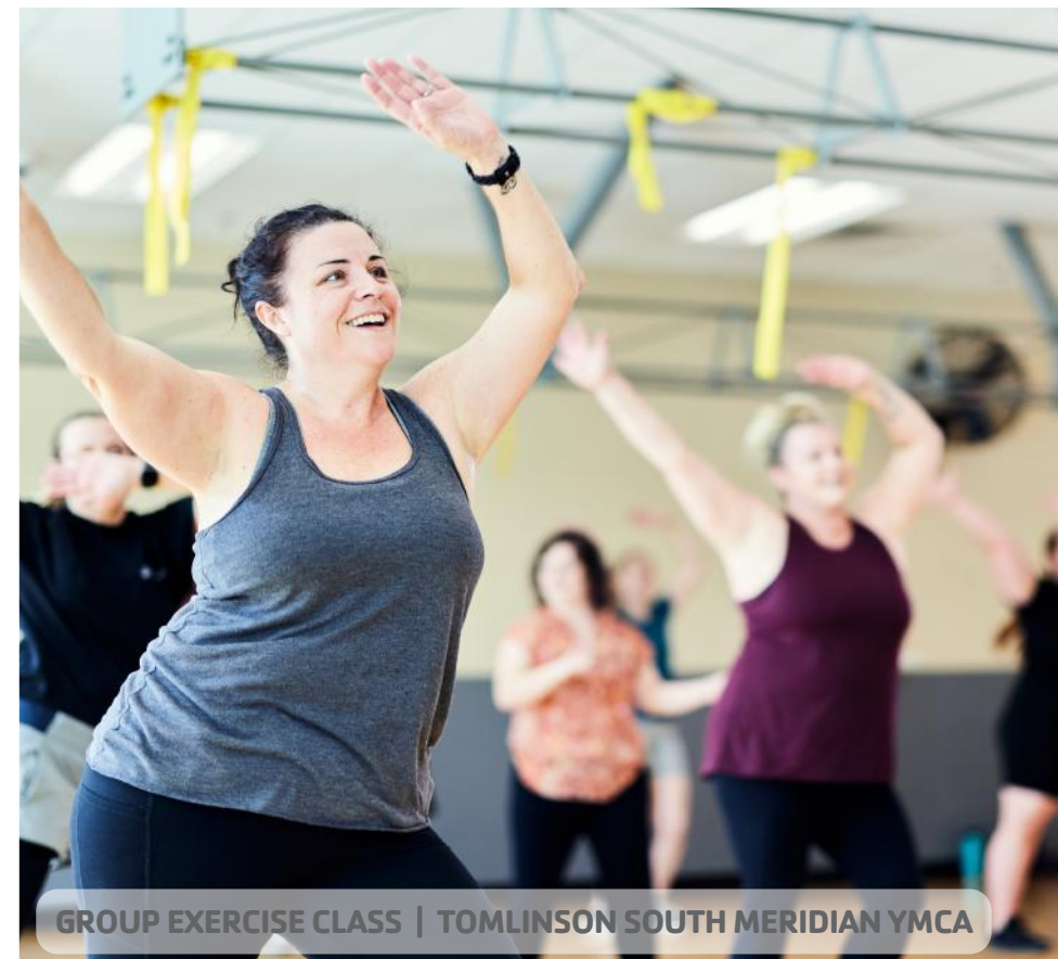
GROUP EXERCISE CLASS | TOMLINSON SOUTH MERIDIAN YMCA

The Y strengthens the foundations of the community by developing successful youth, engaging people in healthy living, and instilling a commitment to social responsibility.