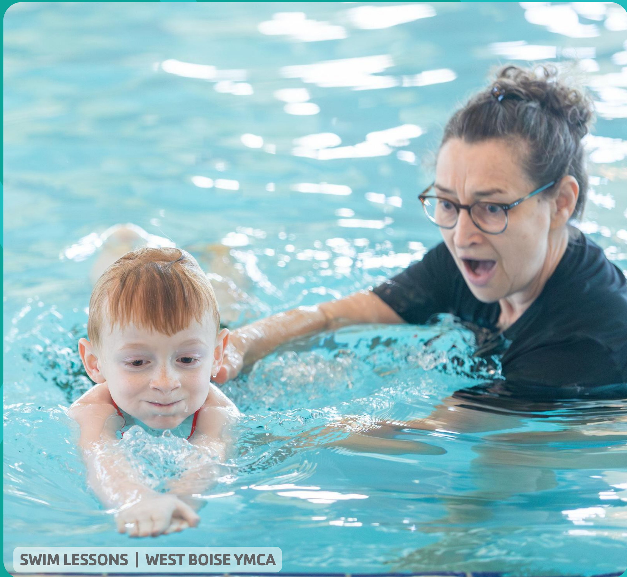
SWIM LESSONS | WEST BOISE YMCA