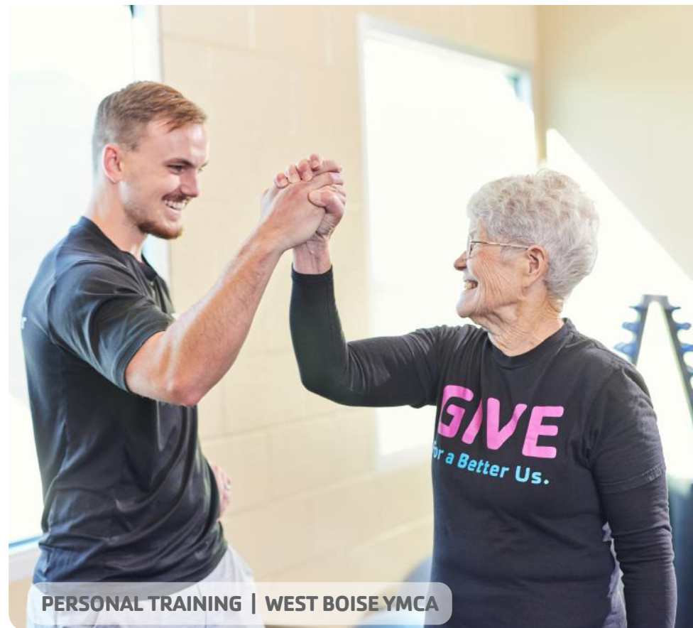
PERSONAL TRAINING | WEST BOISE YMCA