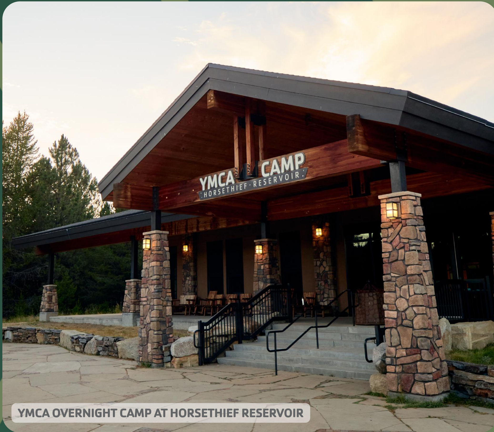
YMCA OVERNIGHT CAMP AT HORSETHIEF RESERVOIR

*These organizations will occasionally double match.