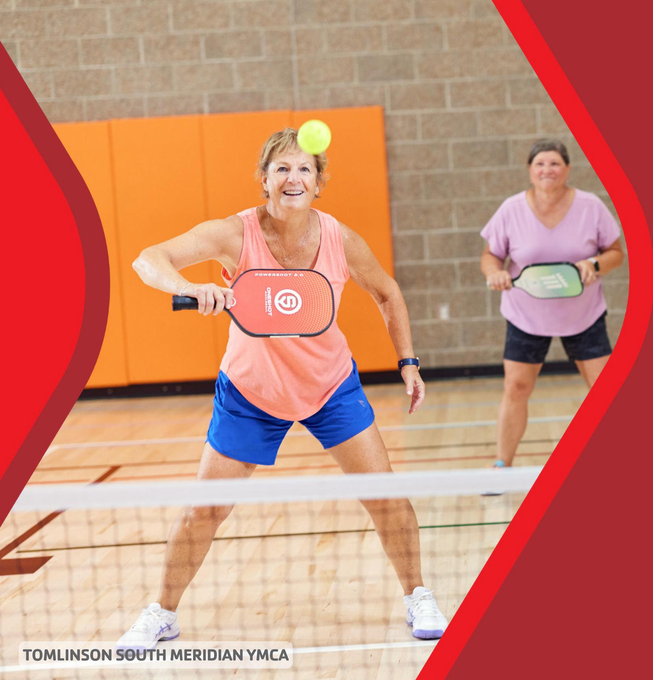
TOMLINSON SOUTH MERIDIAN YMCA