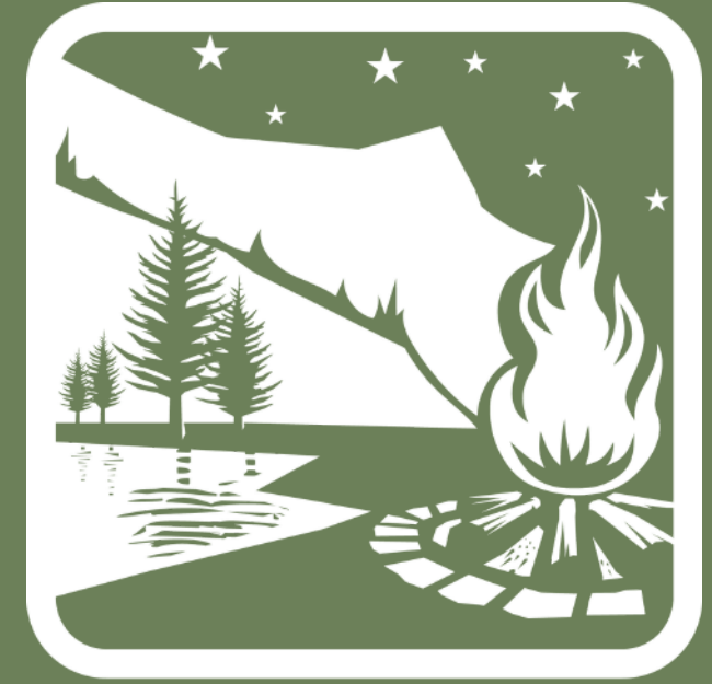
YMCA CAMP AT HORSETHIEF RESERVOIR