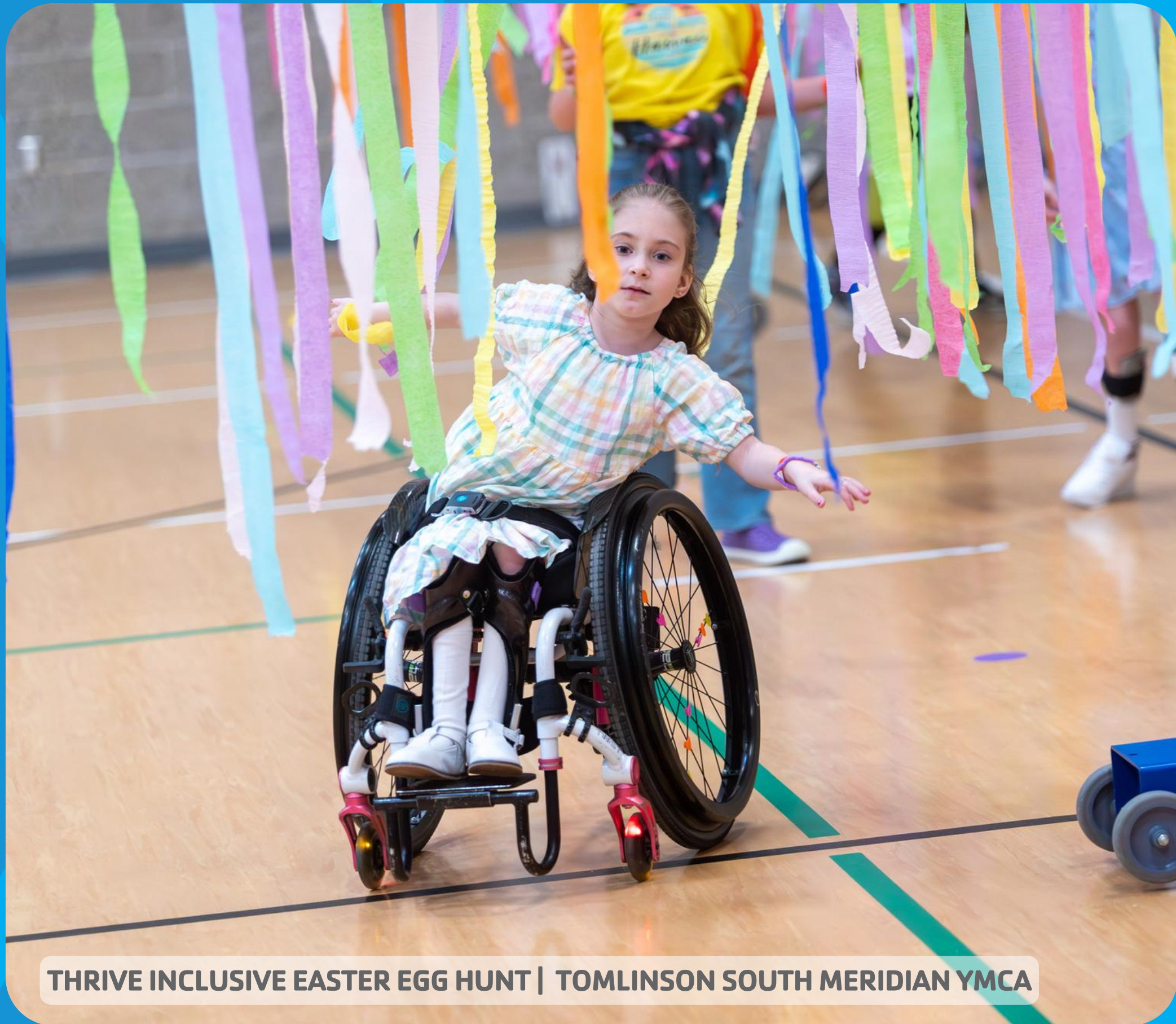
THRIVE INCLUSIVE EASTER EGG HUNT | TOMLINSON SOUTH MERIDIAN YMCA