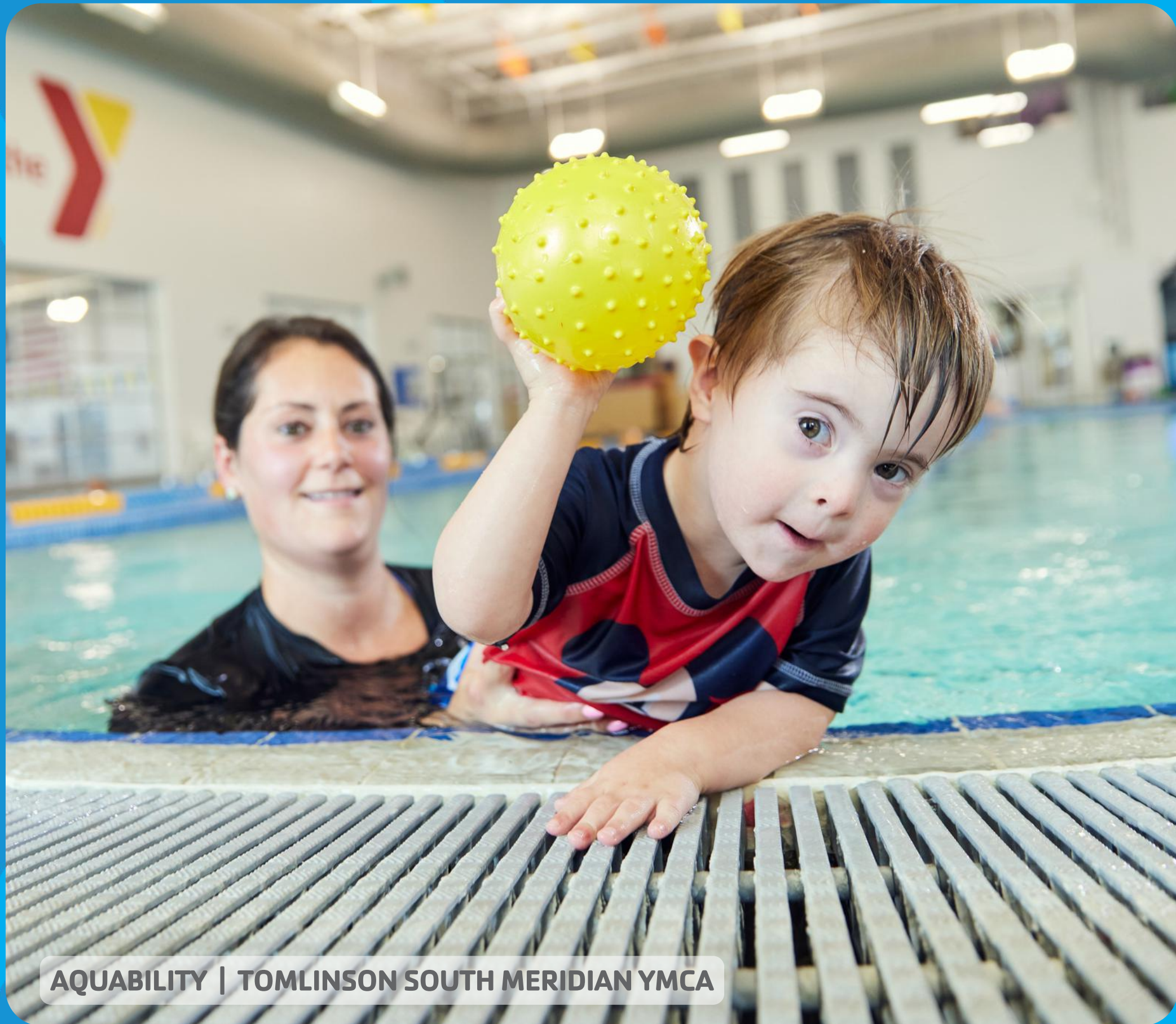
AQUABILITY | TOMLINSON SOUTH MERIDIAN YMCA