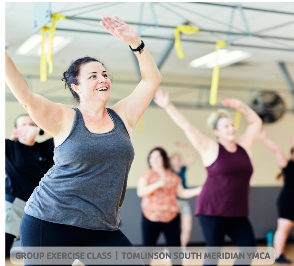
GROUP EXERCISE CLASS | TOMLINSON SOUTH MERIDIAN YMCA

The Y strengthens the foundations of the community by developing successful youth, engaging people in healthy living, and instilling a commitment to social responsibility.