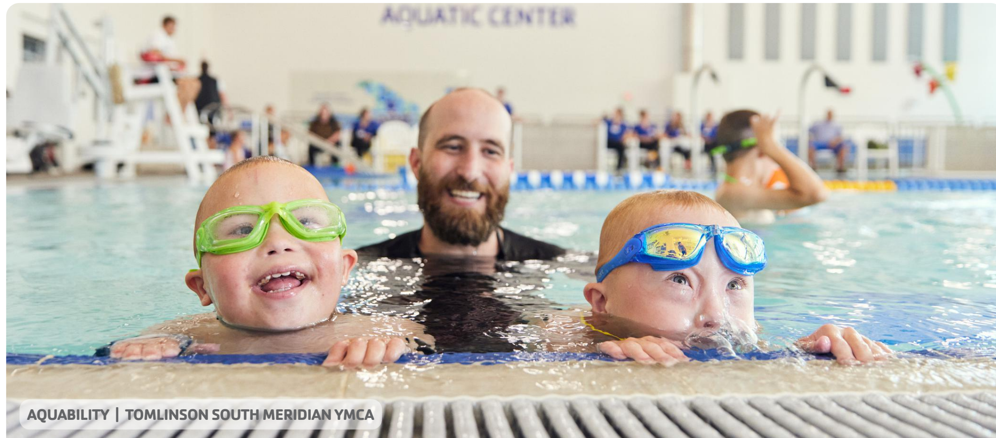
AQUABILITY | TOMLINSON SOUTH MERIDIAN YMCA