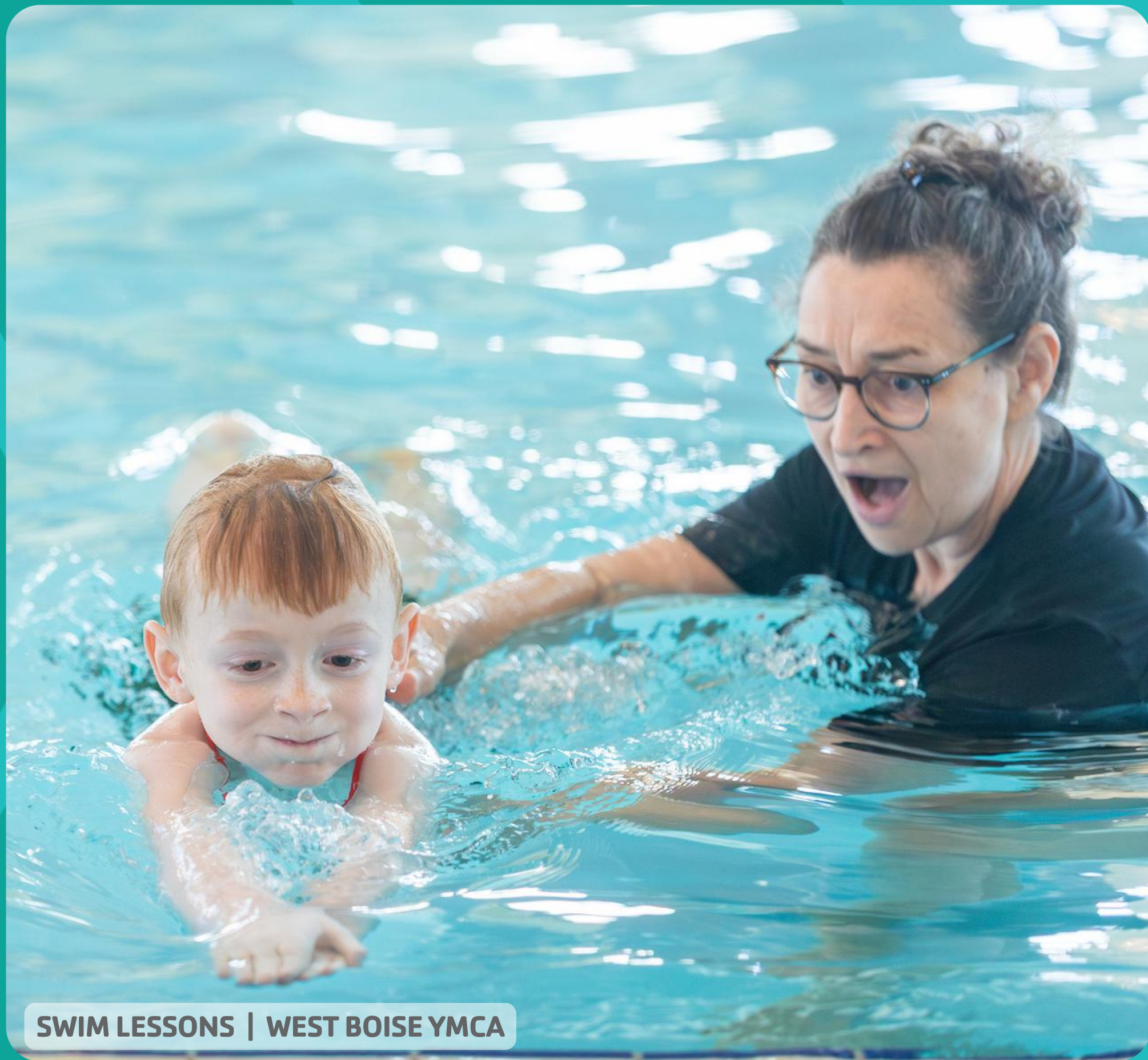
SWIM LESSONS | WEST BOISE YMCA