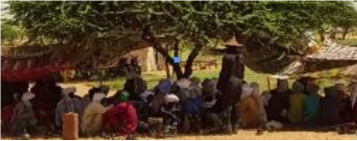
Woodabe in Niger