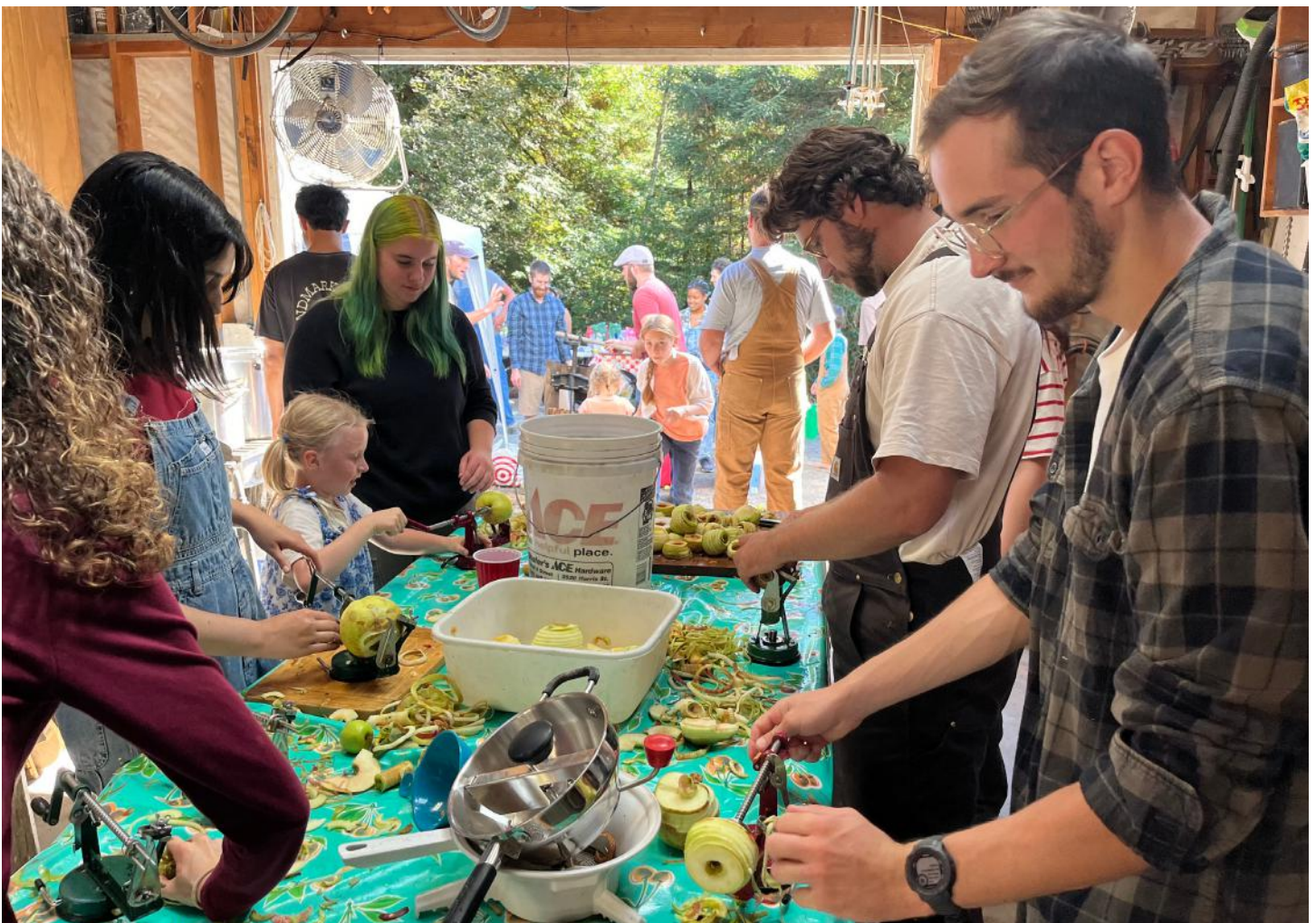
Solid Rock at the annual Apple Day event last fall

When putting the above two paragraphs together, our year in review looks like – “God is bringing us many people to hear about Him for the first time, and God is independently bringing us those who are just taking their first steps in the kingdom to receive discipleship.”