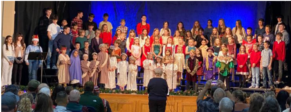
2024 ACS Christmas program