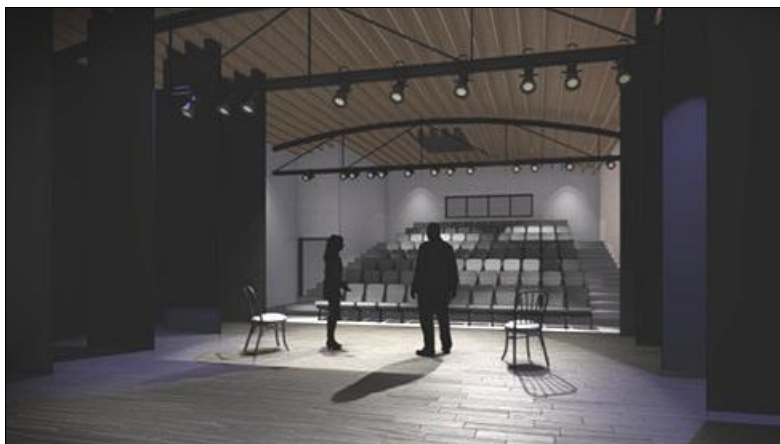
Architect's rendering of what an actor would see while standing upstage right on the new TNT stage