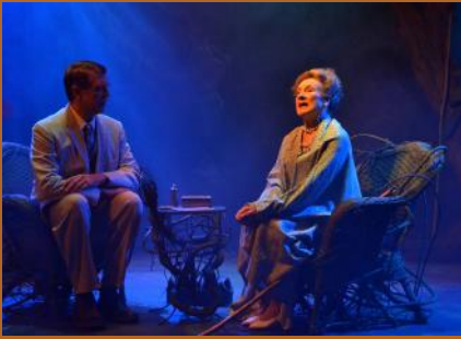
SUDDENLY LAST SUMMER by Tennessee Williams