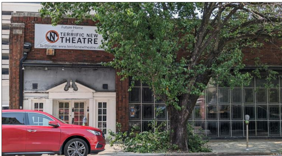
TNT's newly acquired building at 2112 5th Ave. N., Birmingham, AL 35203