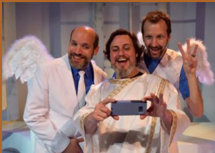
AN ACT OF GOD by David Javerbaum

Theater actively seeks out and amplifies the voices of marginalized communities, including people of all races, ethnicities, genders, sexual orientations, disabilities, and socio-economic backgrounds. Theater provides a means for people to be seen, heard, and understood.