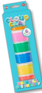
SUPER SOFT CLAY