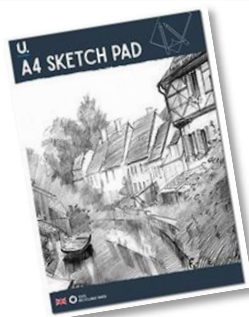
A4 ARTIST PAD