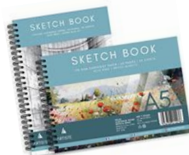
A5 ARTIST PAD