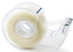
TAPE & DISPENSER